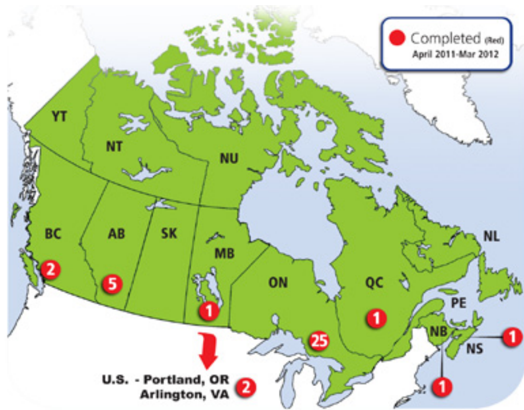
2011-2012 Conferences Attended

Total Conferences: 37 Conferences attended: 33 Sent materials: 4 additional events Presented: 22 speaking engagements Exhibited: 25 venues Potential reach: 27,045 attendees