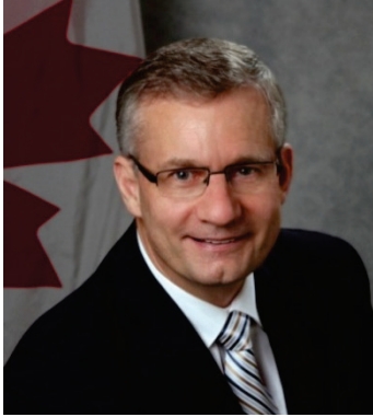
The Honourable Ed Fast Minister for International Trade and Minister for the Asia-Pacific Gateway