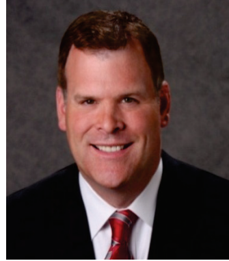
The Honourable John Baird Minister of Foreign Affairs

We are pleased to present the 2013-14 Report on Plans and Priorities for Foreign Affairs and International Trade Canada (DFAIT). This report provides an overview of Canada's foreign affairs and international trade priorities and important ongoing work for the coming year.