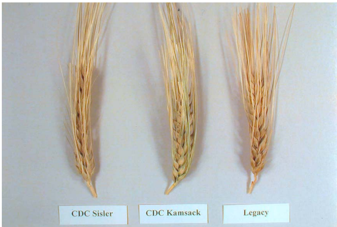
Barley: 'CDC Kamsack' (centre) with reference varieties 'CDC Sisler' (left) and 'Legacy' (right)