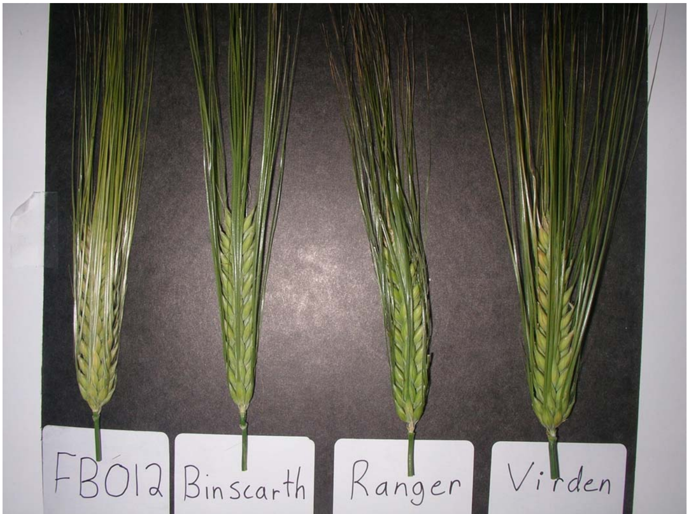
Barley: 'Desperado' (left) with reference varieties 'Binscarth' (centre left), 'Ranger' (centre right) and 'Virden' (right)