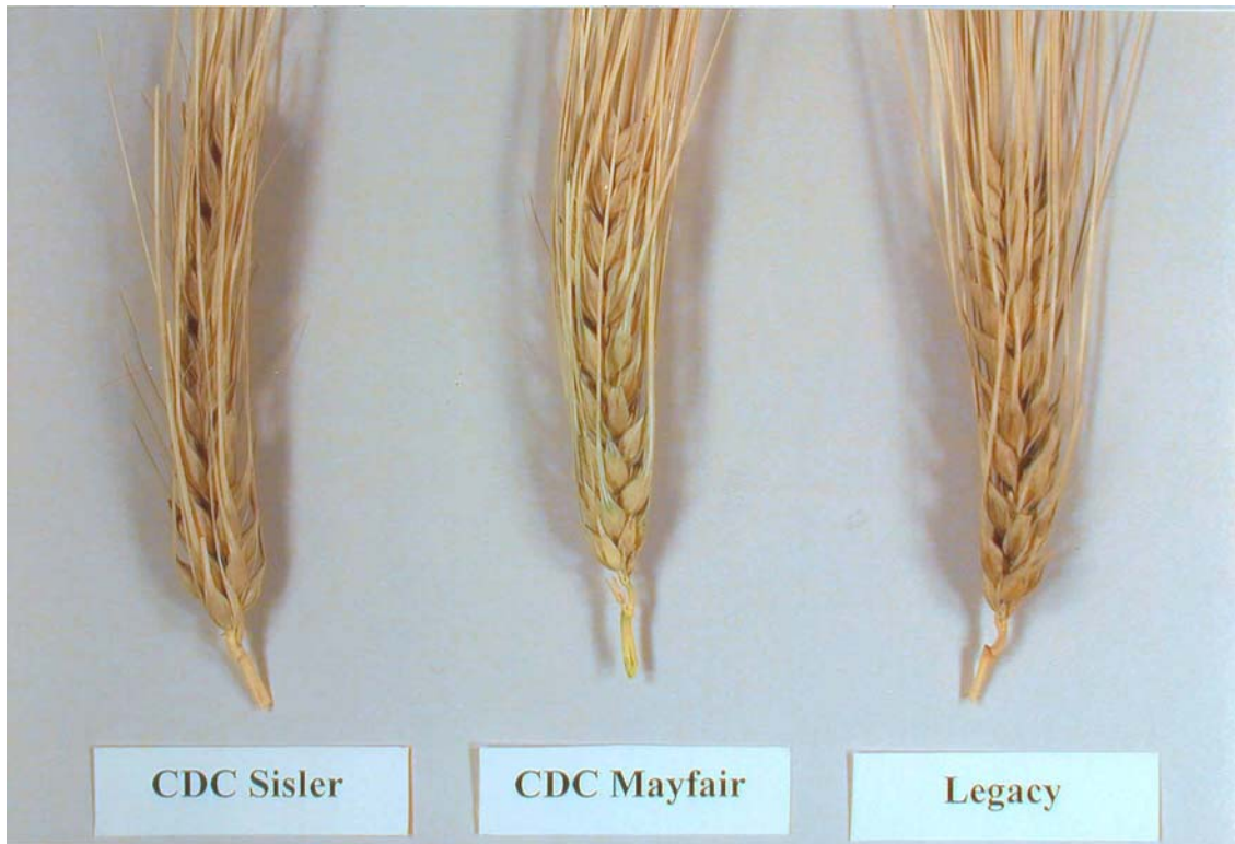
Barley: 'CDC Mayfair' (centre) with reference varieties 'CDC Sisler' (left) and 'Legacy' (right)