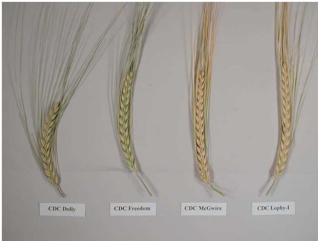
Barley: 'CDC Lophy-I' (far right) with reference varieties 'CDC Dolly' (far left), 'CDC Freedom' (centre left) and 'CDC McGwire' (centre right)