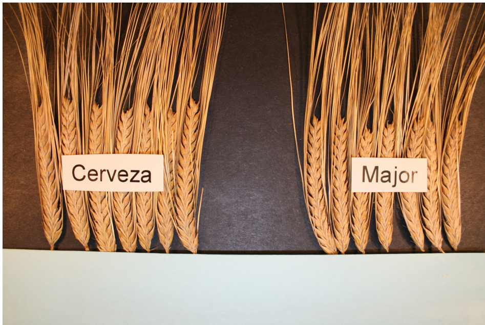
Barley: 'Major' (right) with reference variety 'Cerveza' (left)