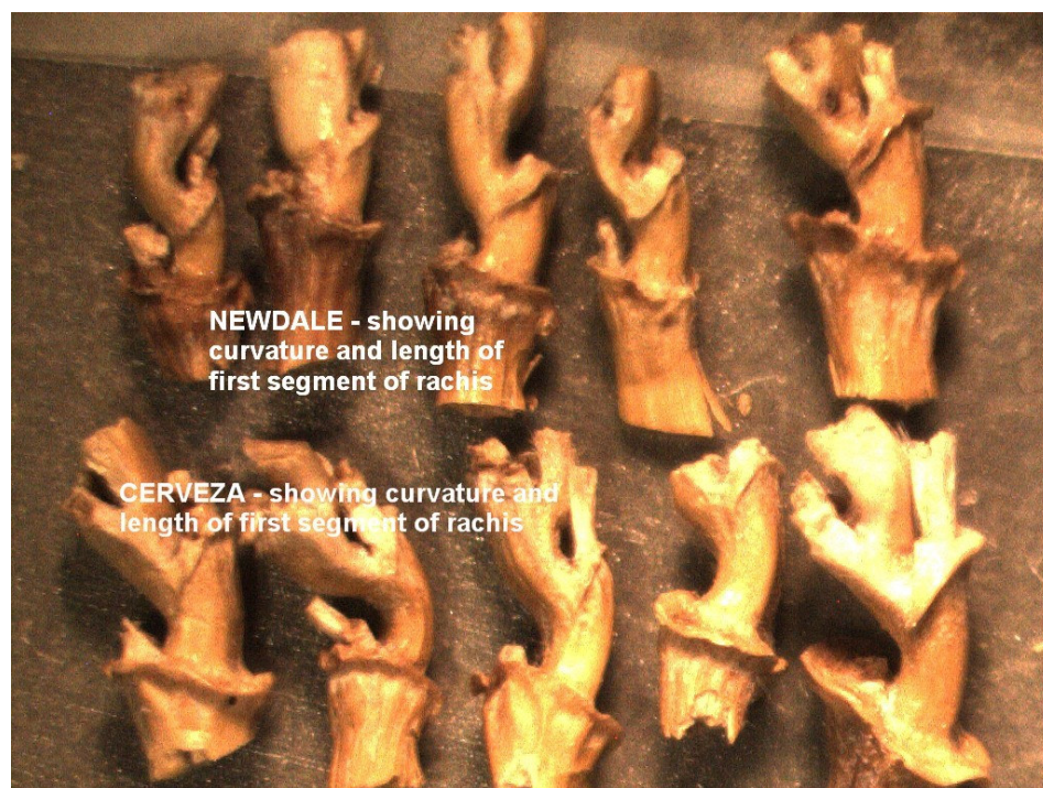
Barley: 'Cerveza' (bottom) with reference variety 'Newdale' (top)