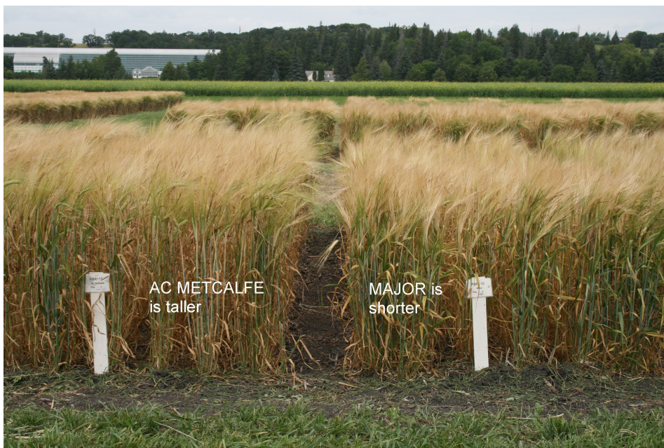
Barley: 'Major' (right) with reference variety 'AC Metcalfe' (left)