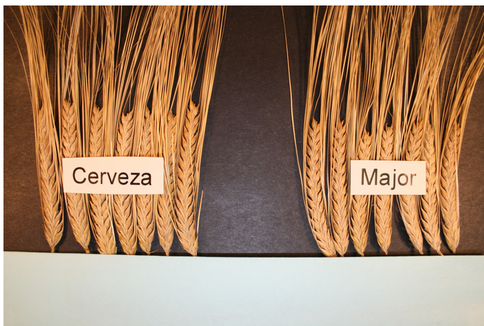
Barley: 'Cerveza' (left) with reference variety 'Major' (right)