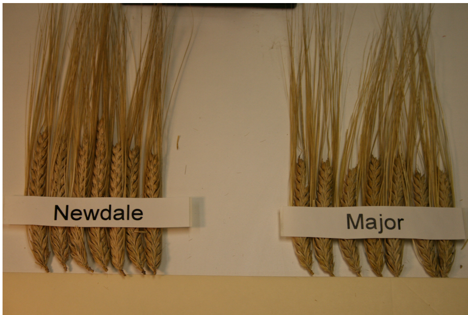
Barley: 'Major' (right) with reference variety 'Newdale' (left)