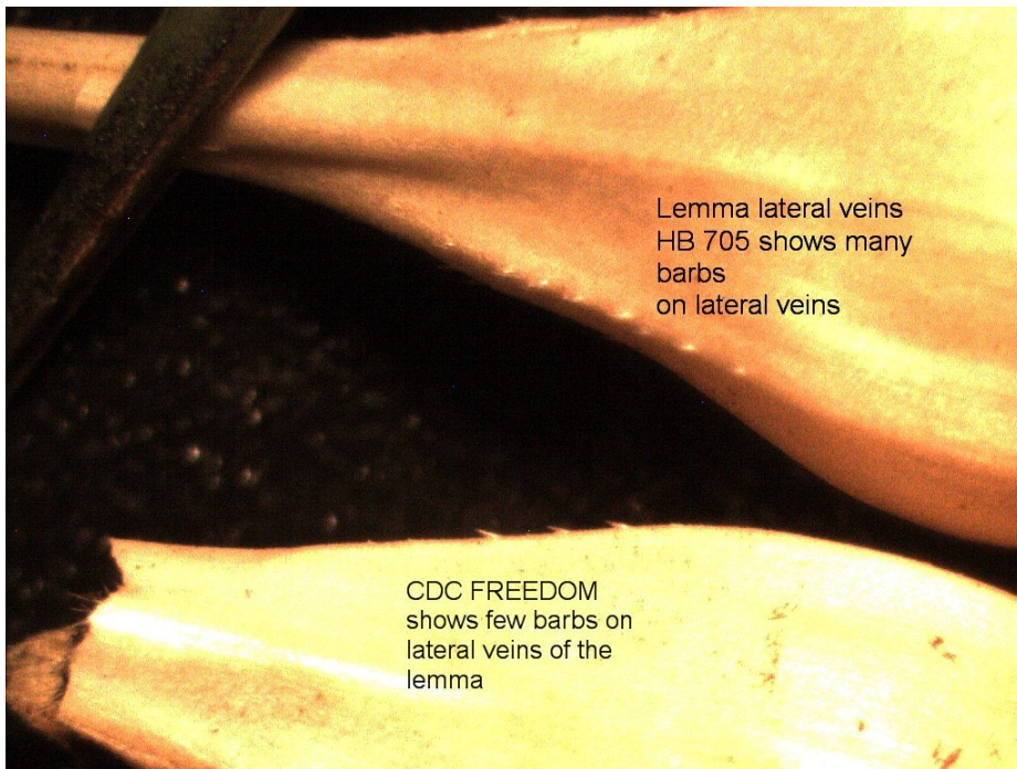
Barley: 'Taylor' (top) with reference variety 'CDC Freedom' (bottom)