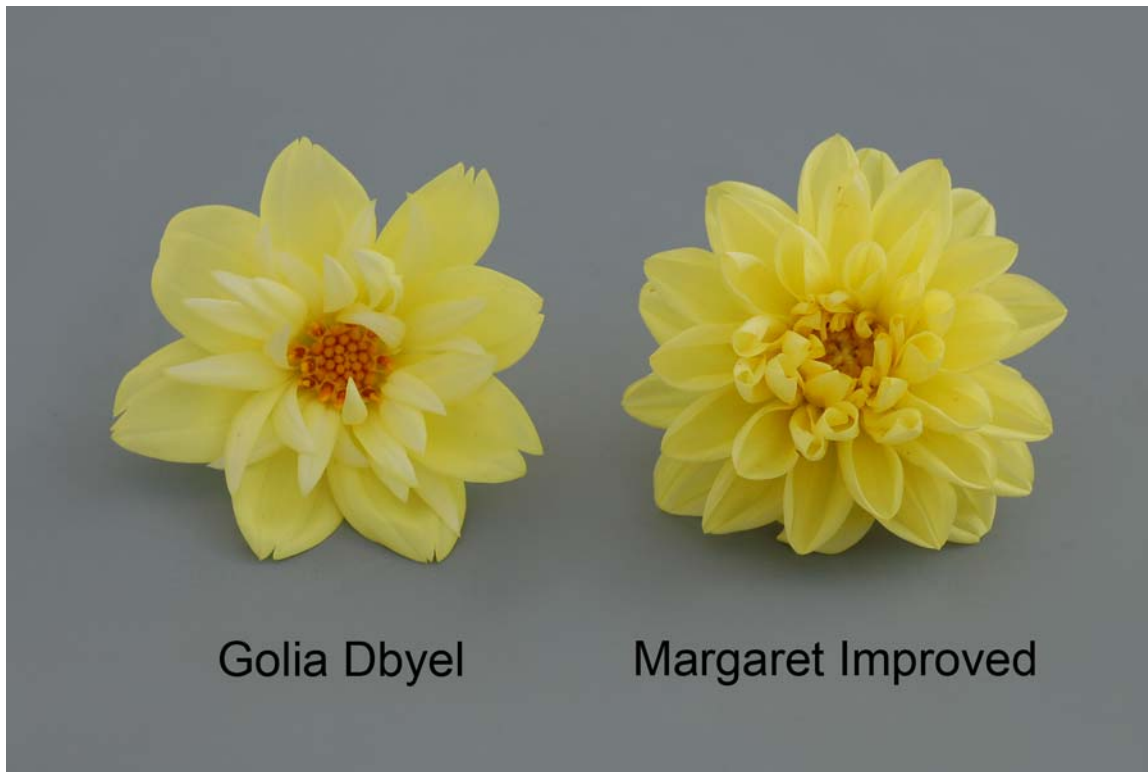
Dahlia: 'Golia Dbyel' (left) with reference variety 'Margaret Improved' (right)