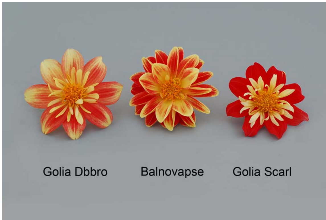
Dahlia: 'Golia Dbbro' (left) with reference varieties 'Balnovapse' (centre) and 'Golia Scarl' (right)