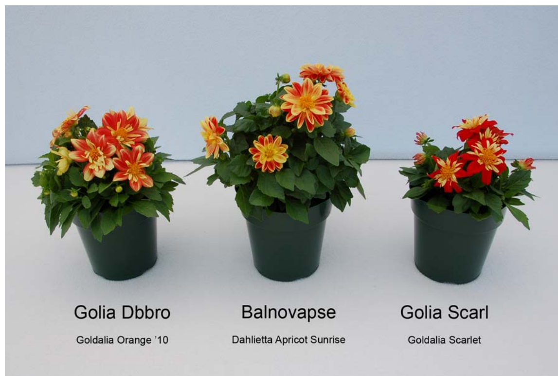
Dahlia: 'Golia Dbbro' (left) with reference varieties 'Balnovapse' (centre) and 'Golia Scarl' (right)