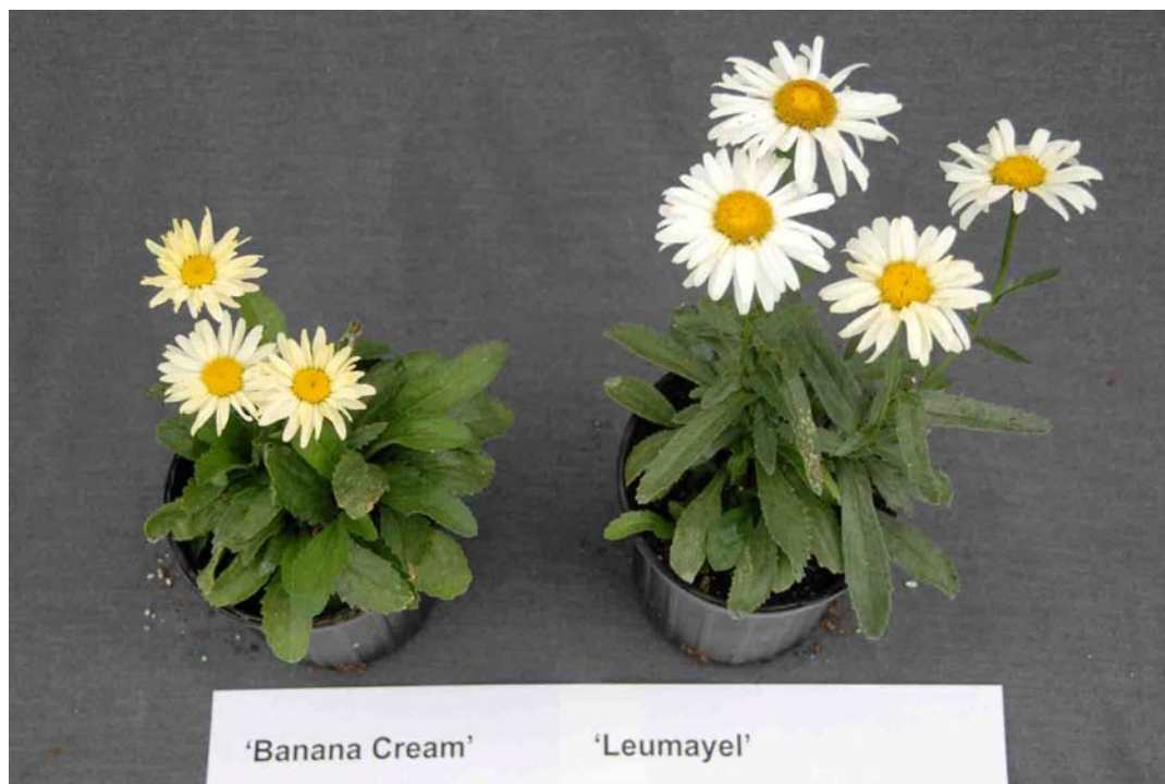
Shasta Daisy: 'Banana Cream' (left) with reference variety 'Leumayel' (right)