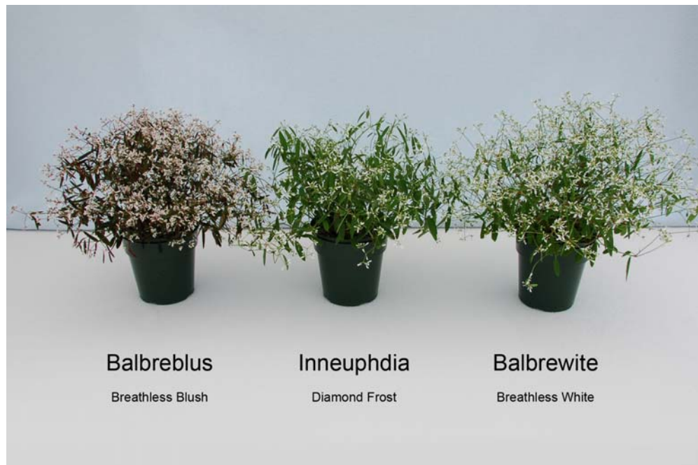
Euphorbia: 'Balbreblus' (left) with reference varieties 'Inneuphdia' (center) and 'Balbrewite' (right)