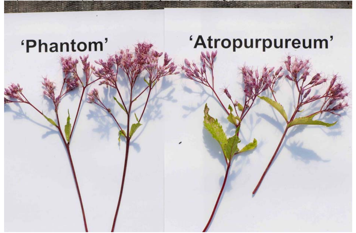
Eupatorium: 'Phantom' (left) with reference variety 'Atropurpureum' (right)