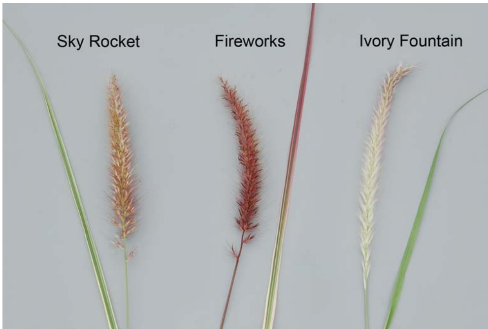
Fountain Grass: 'Sky Rocket' (left) with reference varieties 'Fireworks' (center) and 'Ivory Fountain' (right)