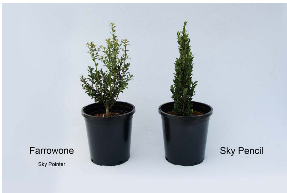
Holly: 'Farrowone' (left) with reference variety 'Sky Pencil' (right)