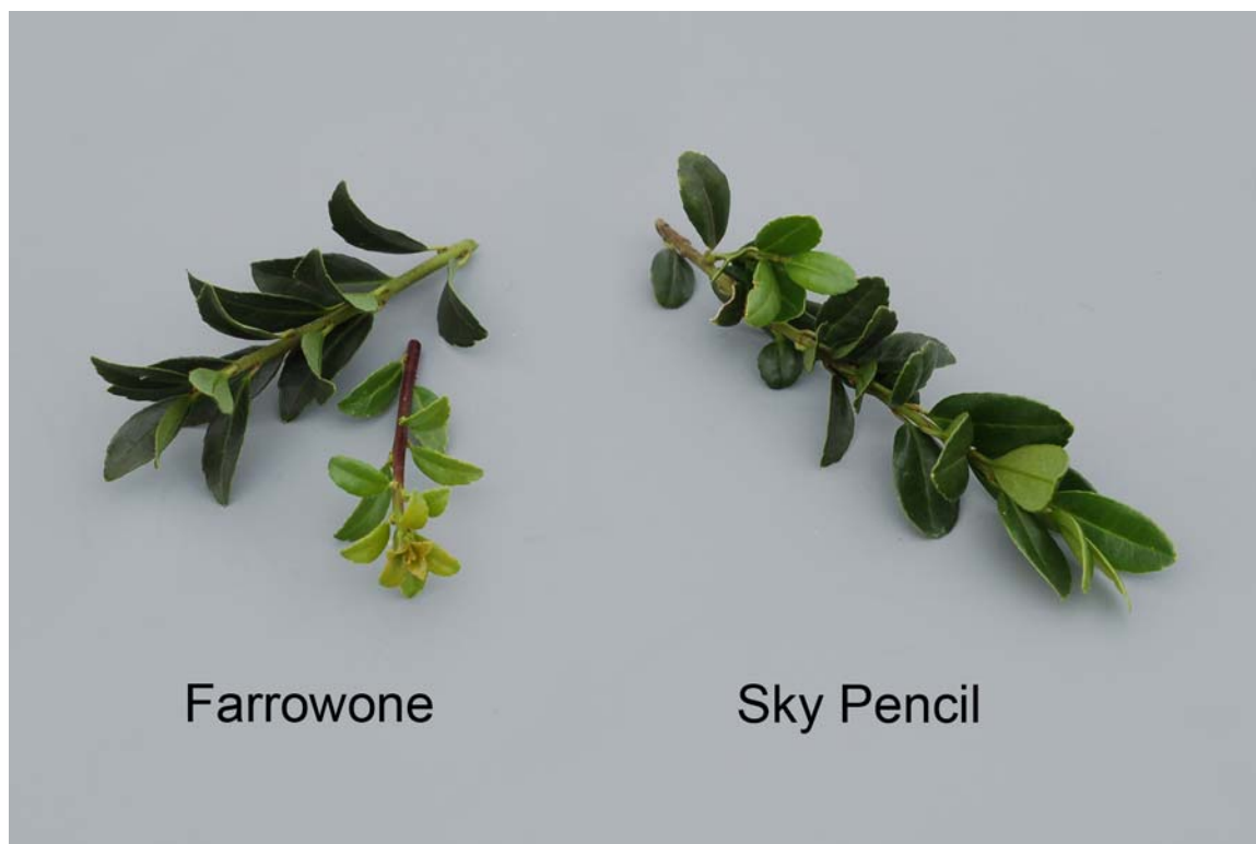
Holly: 'Farrowone' (left) with reference variety 'Sky Pencil' (right)