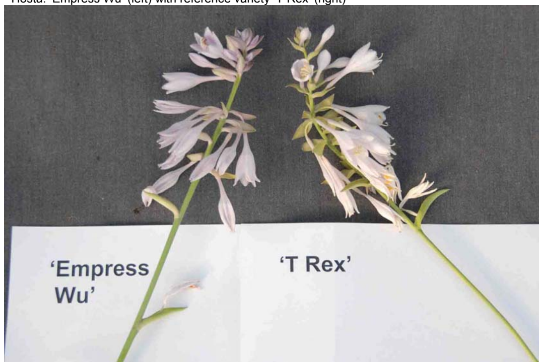
Hosta: 'Empress Wu' (left) with reference variety 'T Rex' (right)