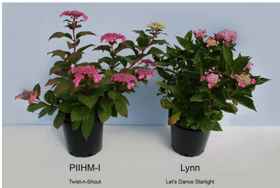
Hydrangea: 'PIIHM-I' (left) with reference variety 'Lynn' (right)