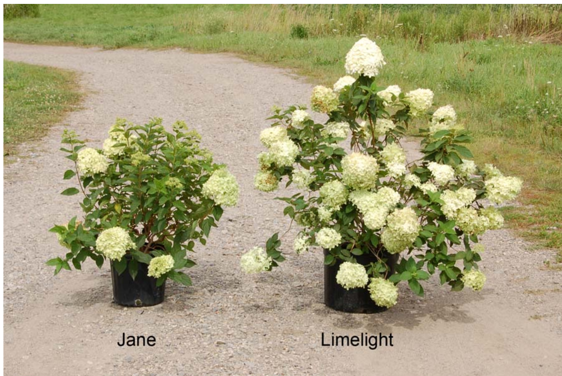
Hydrangea: 'Jane' (left) with reference variety 'Limelight' (right)