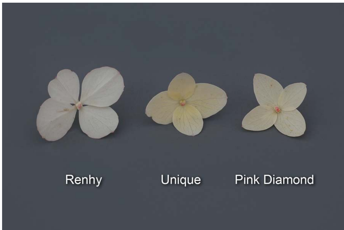
Hydrangea: 'Renhy' (left) with reference varieties 'Unique' (centre) and 'Pink Diamond' (right)