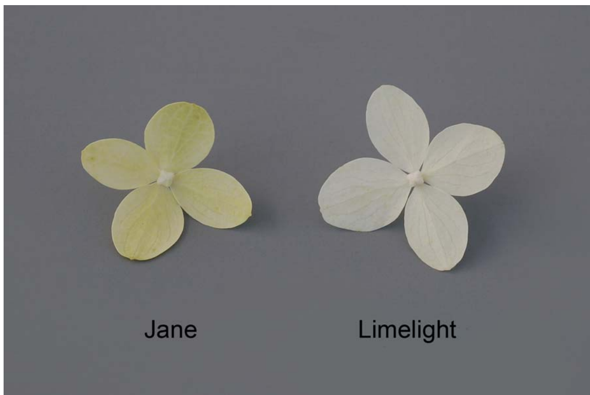
Hydrangea: 'Jane' (left) with reference variety 'Limelight' (right)