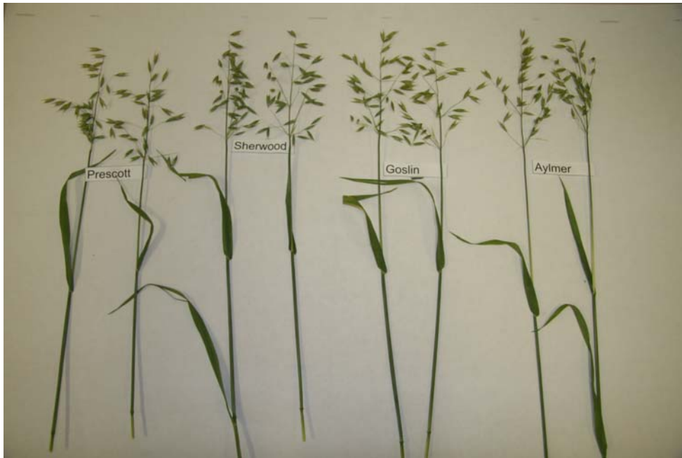
Oat: 'Sherwood' (centre, left) with reference varieties 'Prescott' (left), 'Goslin' (centre, right) and 'Aylmer' (right)