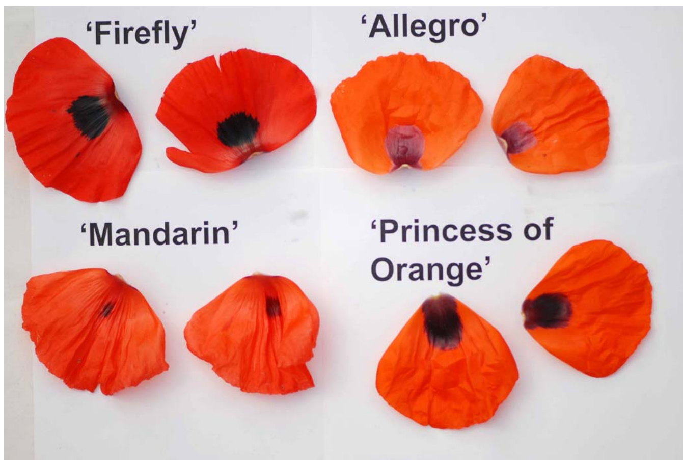
Oriental Poppy: 'Mandarin' (bottom left) with reference varieties 'Firefly' (top left), 'Allegro' (top right) and 'Princess of Orange' (bottom right)