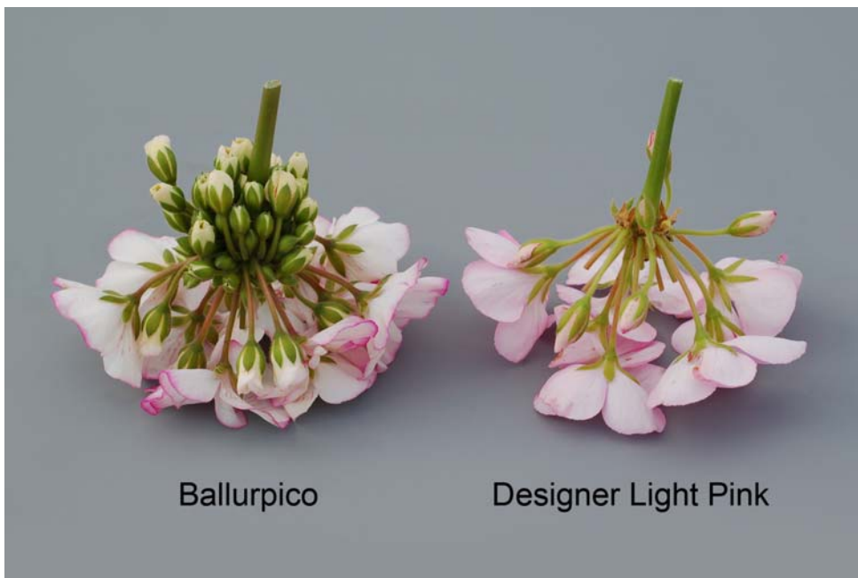
Pelargonium: 'Ballurpico' (left) with reference variety 'Designer Light Pink' (right)