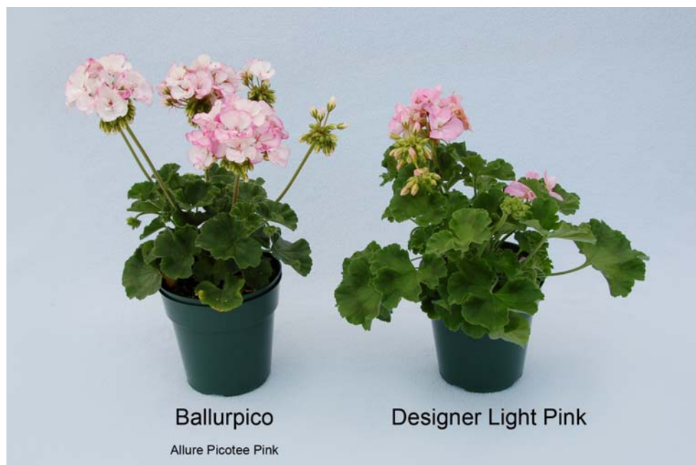
Pelargonium: 'Ballurpico' (left) with reference variety 'Designer Light Pink' (right)