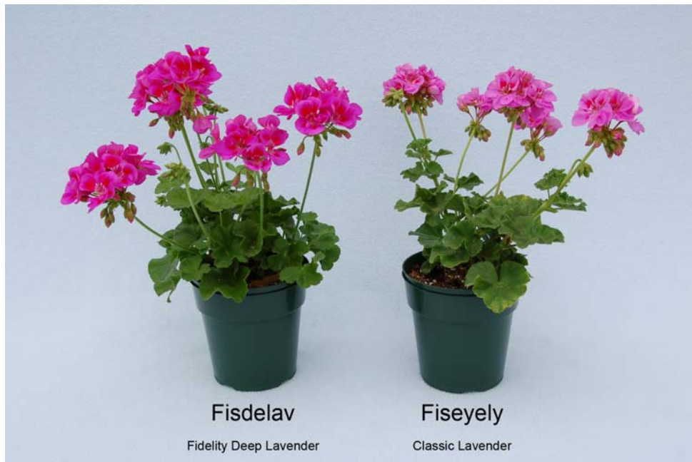
Pelargonium: ‘Fisdelv’ (left) with reference variety ‘Fiseyely’ (right)