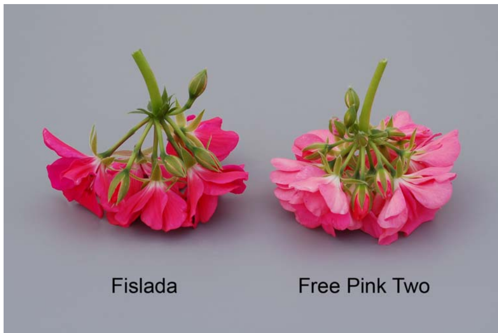
Pelargonium: 'Fislada' (left) with reference variety 'Free Pink Two' (right)