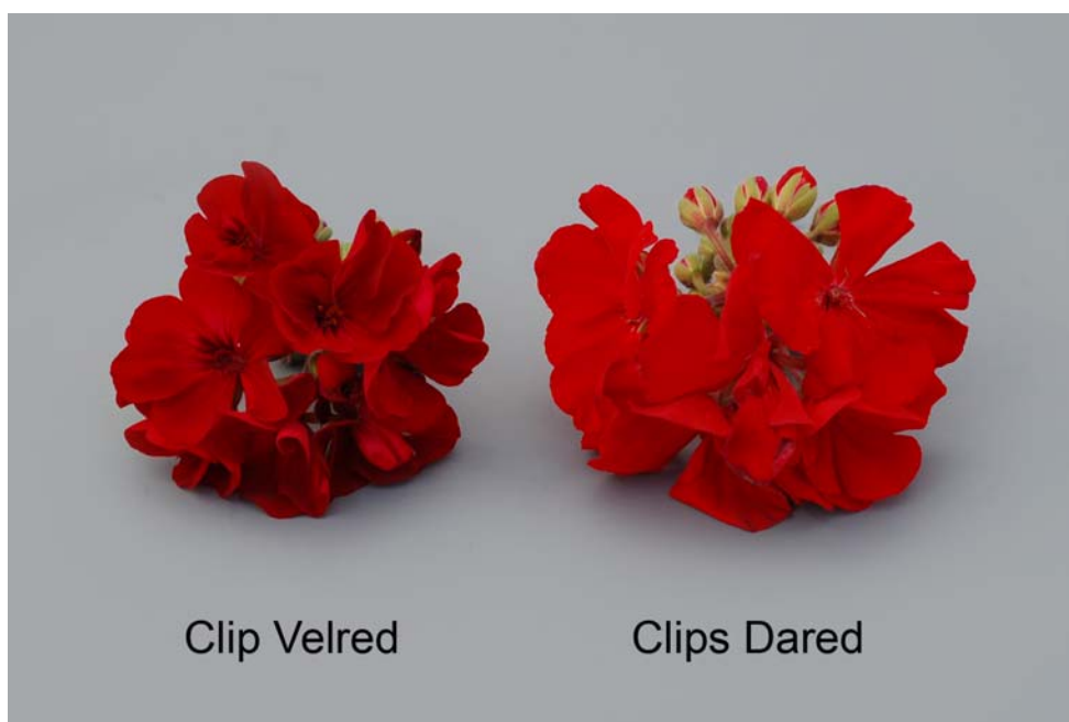
Pelargonium: 'Clip Velred' (left) with reference variety 'Clips Dared' (right)