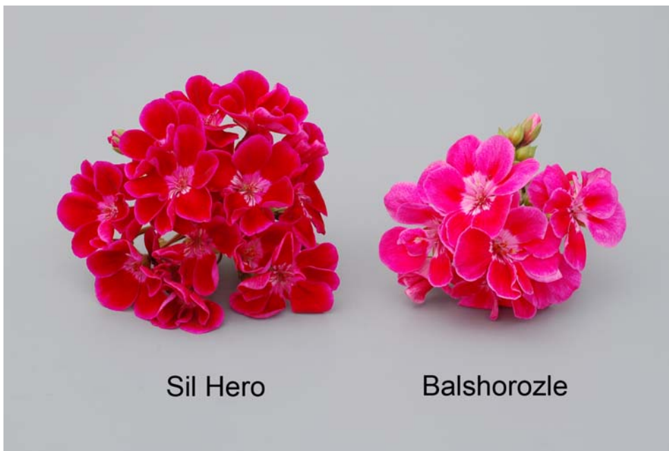
Pelargonium: 'Sil Hero' (left) with reference variety 'Balshorozle' (right)