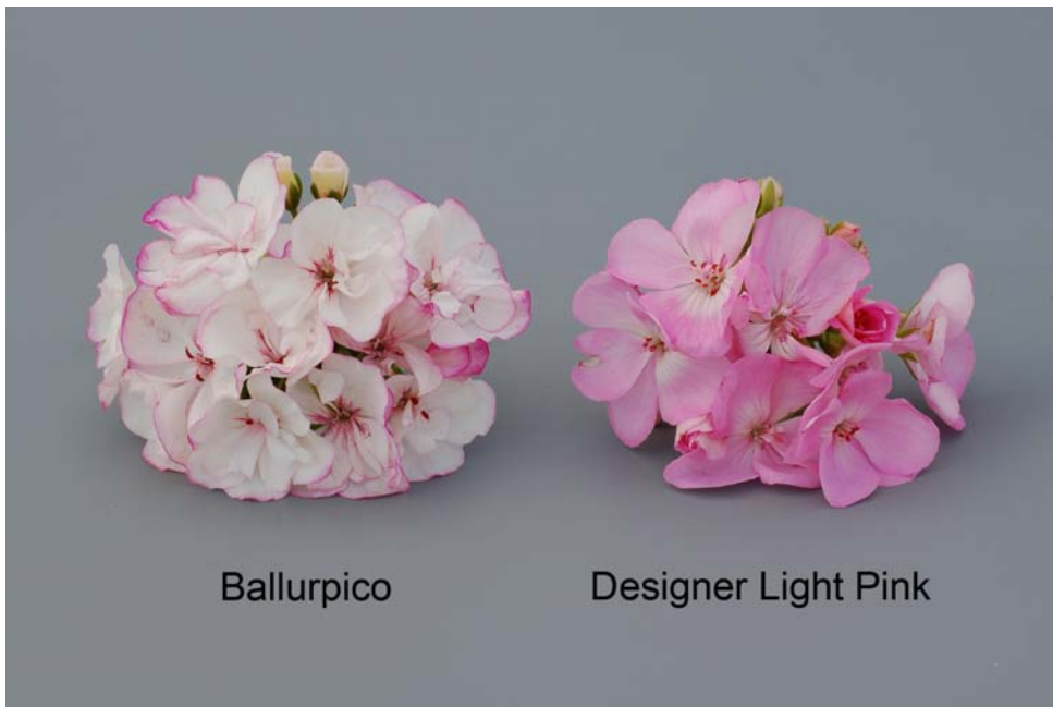
Pelargonium: 'Ballurpico' (left) with reference variety 'Designer Light Pink' (right)