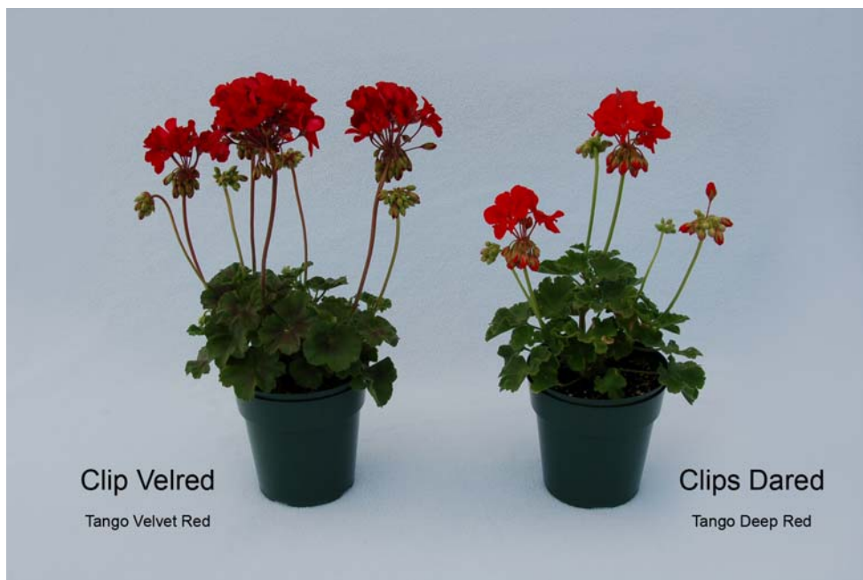
Pelargonium: 'Clip Velred' (left) with reference variety 'Clips Dared' (right)