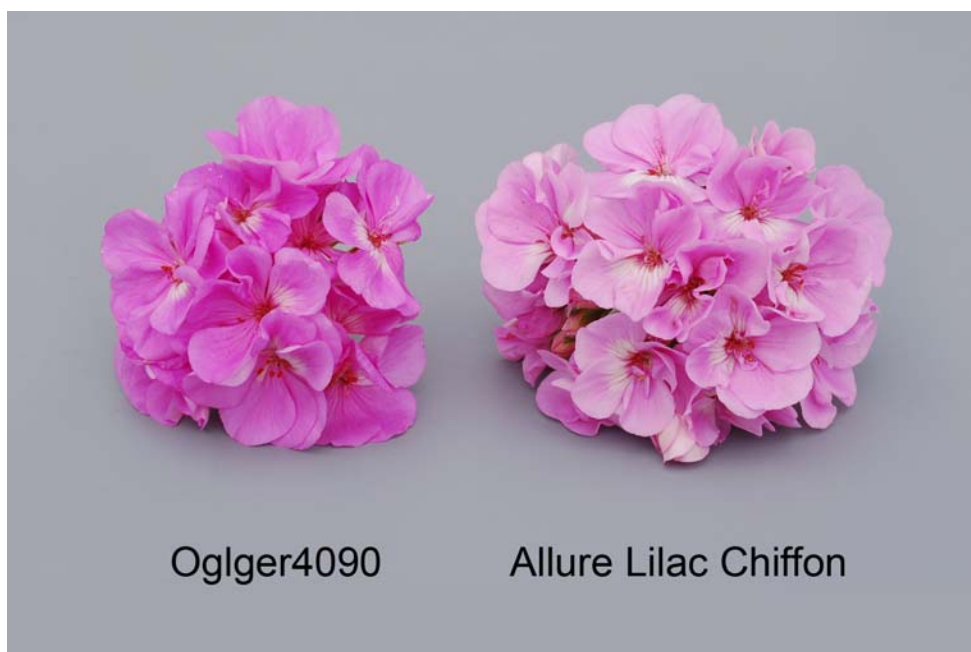
Pelargonium: 'Oglger4090' (left) with reference variety 'Allure Lilac Chiffon' (right)