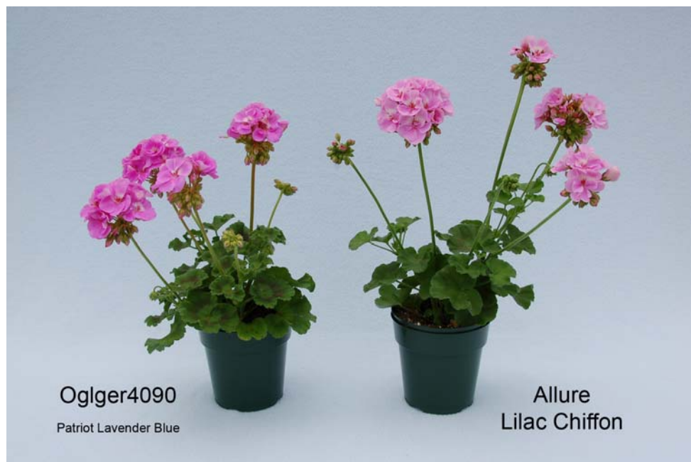
Pelargonium: ‘Oglger4090’ (left) with reference variety ‘Allure Lilac Chiffon’ (right)