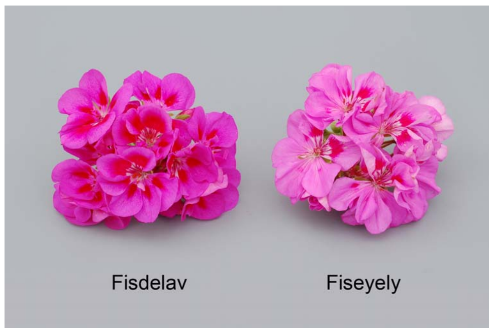
Pelargonium: 'Fisdelav' (left) with reference variety 'Fiseyely' (right)