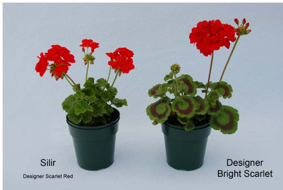
Pelargonium: 'Silir' (left) with reference variety 'Designer Bright Scarlet' (right)