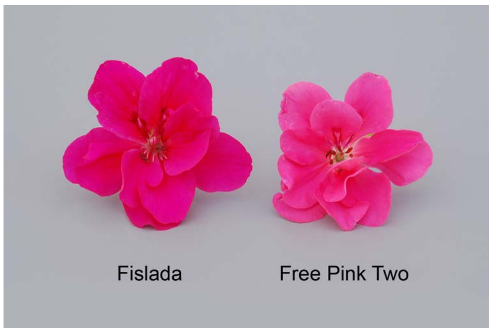
Pelargonium: 'Fislada' (left) with reference variety 'Free Pink Two' (right)