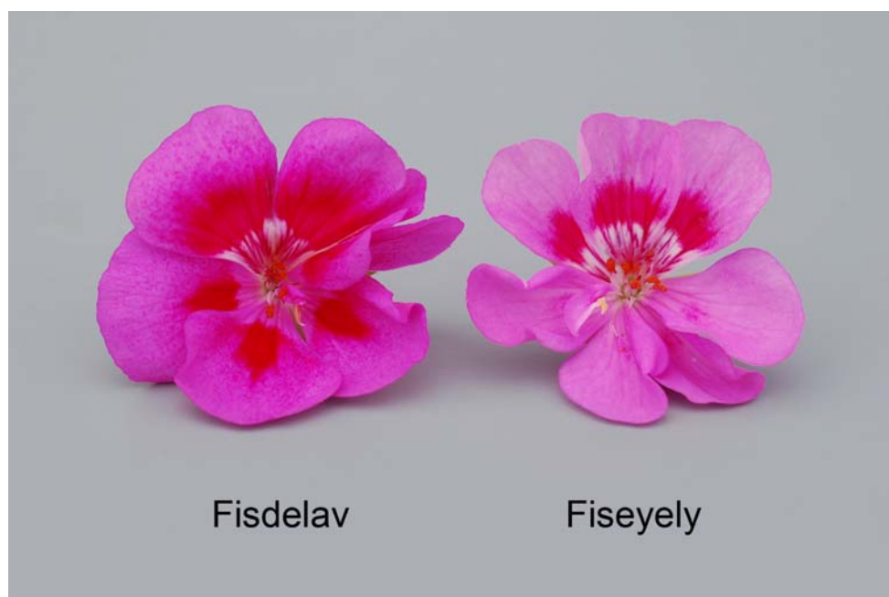
Pelargonium: 'Fisdelav' (left) with reference variety 'Fiseyely' (right)