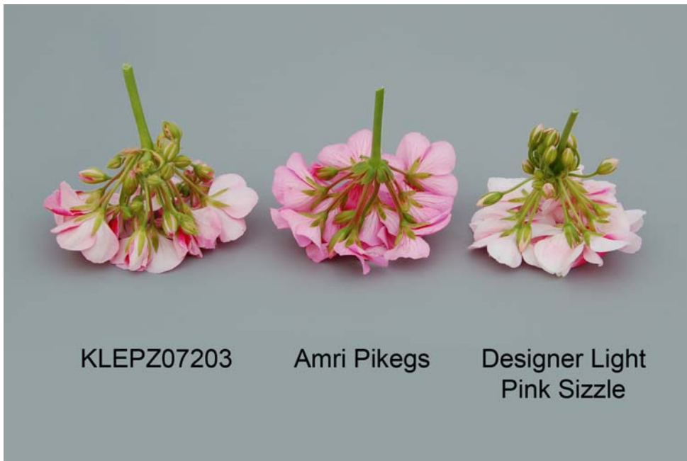
Pelargonium: 'KLEPZ07203' (left) with reference varieties 'Amri Pikegs' (centre) and 'Designer Light Pink Sizzle' (right)