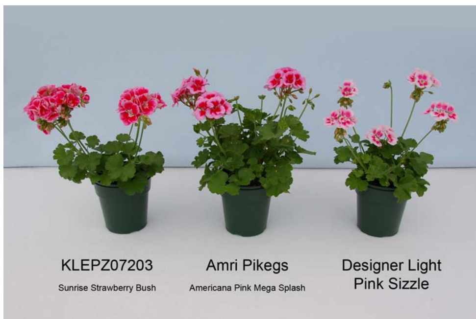
Pelargonium: 'KLEPZ07203' (left) with reference varieties 'Amri Pikegs' (centre) and 'Designer Light Pink Sizzle' (right)