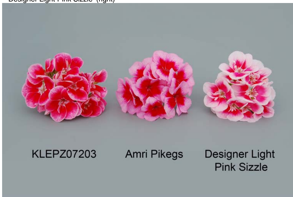
Pelargonium: 'KLEPZ07203' (left) with reference varieties 'Amri Pikegs' (centre) and 'Designer Light Pink Sizzle' (right)