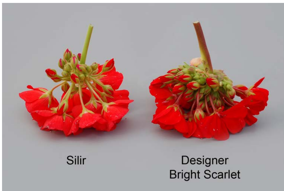
Pelargonium: 'Silir' (left) with reference variety 'Designer Bright Scarlet' (right)