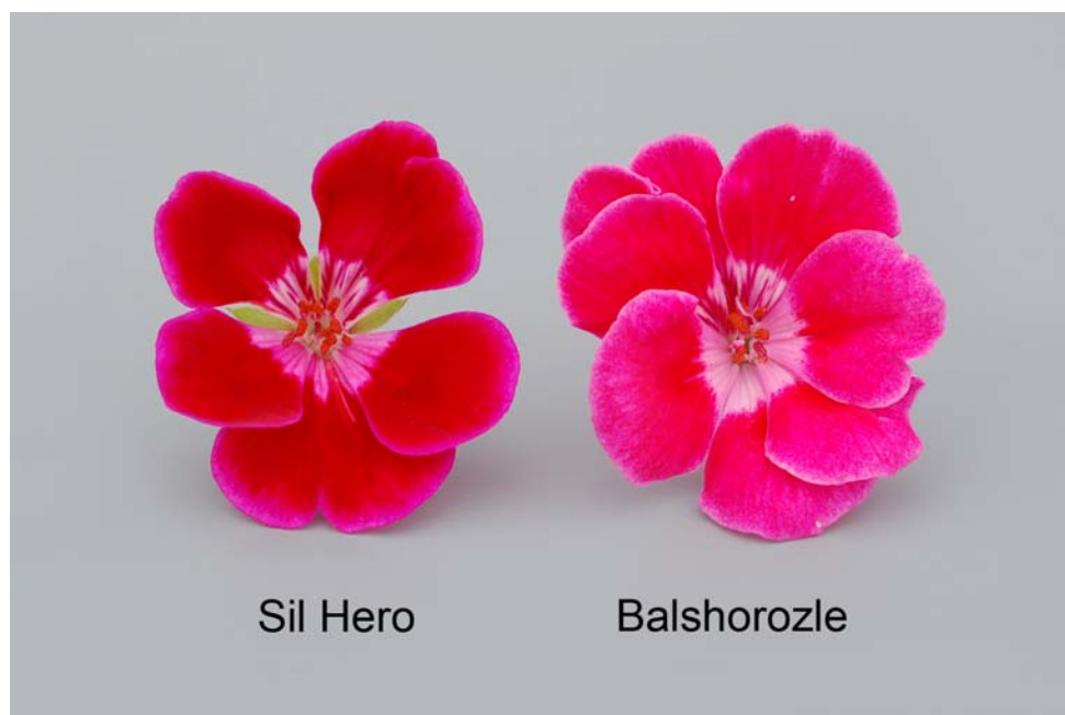
Pelargonium: 'Sil Hero' (left) with reference variety 'Balshorozle' (right)