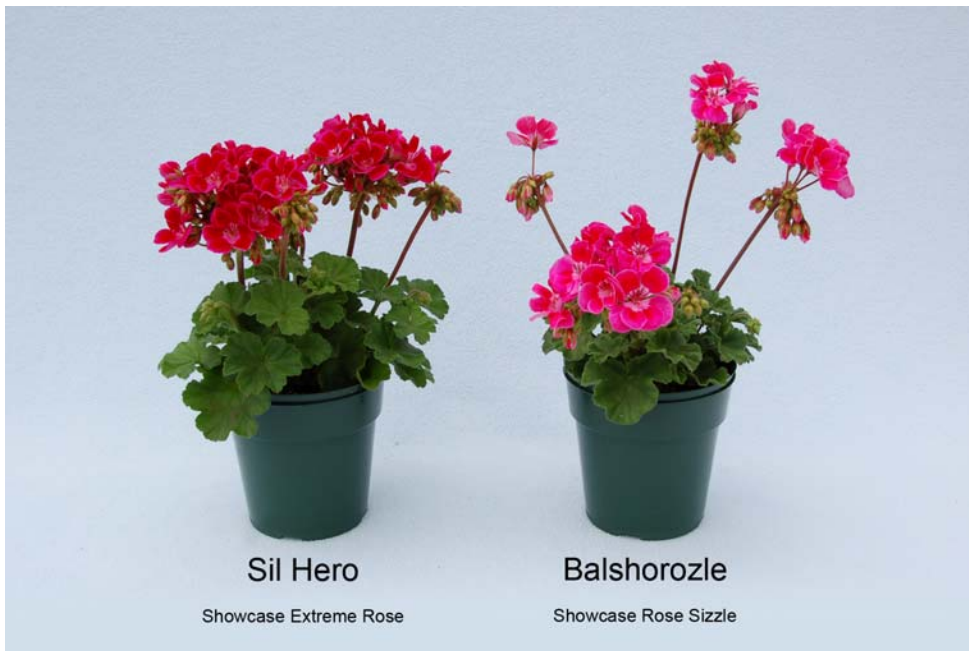
Pelargonium: 'Sil Hero' (left) with reference variety 'Balshorozle' (right)