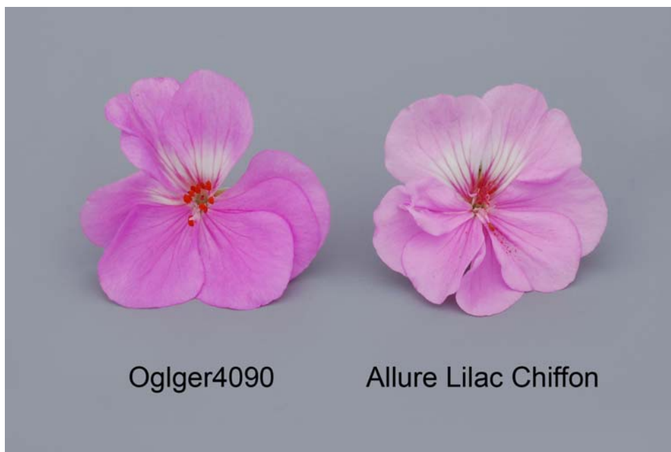
Pelargonium: 'Oglger4090' (left) with reference variety 'Allure Lilac Chiffon' (right)