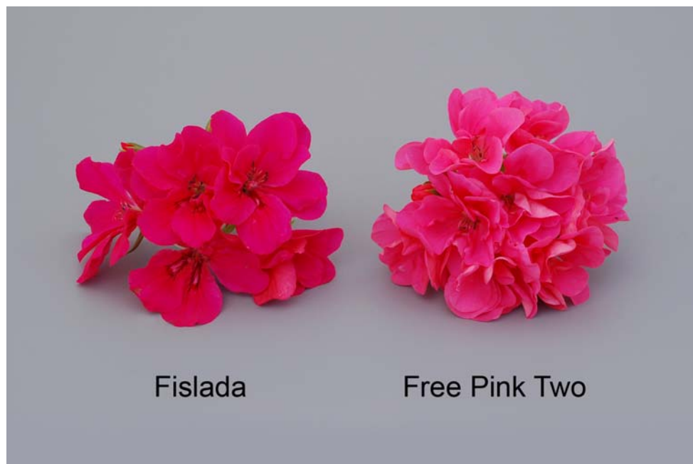
Pelargonium: 'Fislada' (left) with reference variety 'Free Pink Two' (right)