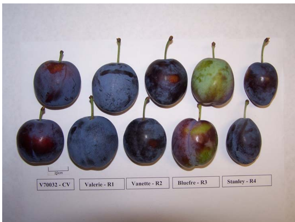
Plum: 'Vandor' (left) with reference varieties 'Valerie' (centre left), 'Vanette' (centre), 'Bluefre' (centre right) and 'Stanley' (right)