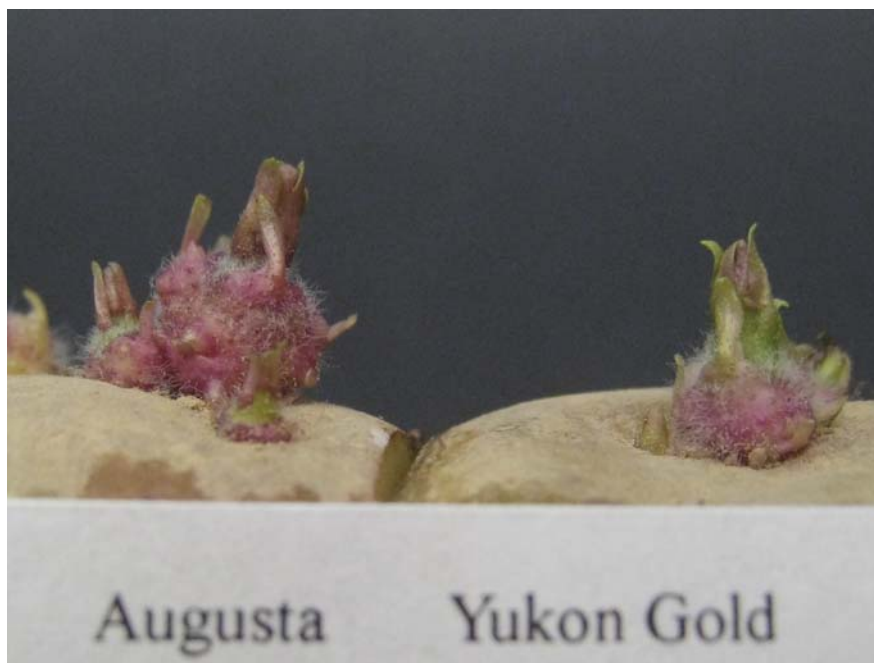
Potato: 'Augusta' (left) with reference variety 'Yukon Gold' (right)

Tests and Trials: Trials for 'Augusta' were conducted during the summer of 2010 in Drummond, New Brunswick. Plots consisted of one row with a row length of 18.5 meters and a row spacing of 90 cm. Plants were spaced 30 cm apart within the row. There were 60 plants per variety in the trial.