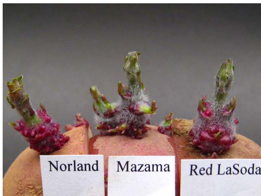
Potato: 'Mazama' (centre) with reference varieties 'Norland' (left) and 'Red LaSoda' (right)