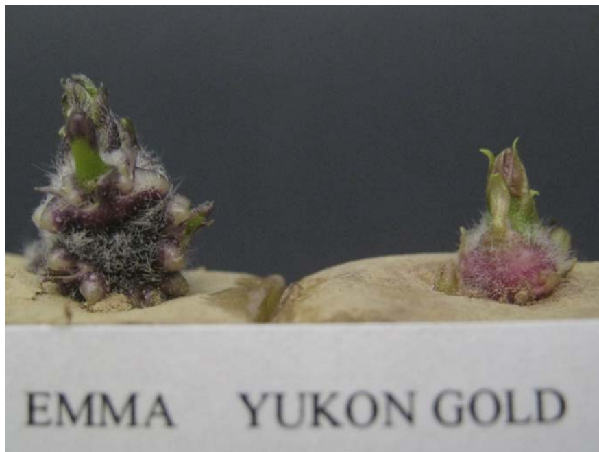
Potato: 'Emma' (left) with reference variety 'Yukon Gold' (right)