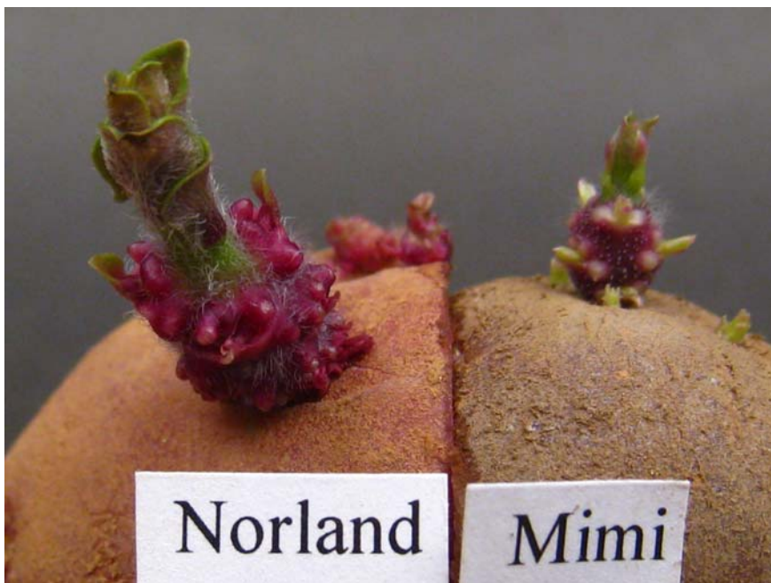
Potato: 'Mimi' (right) with reference variety 'Norland' (left)