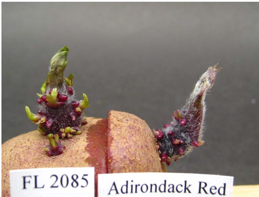
Potato: 'FL2085' (left) with reference variety 'Adirondack Red' (right)