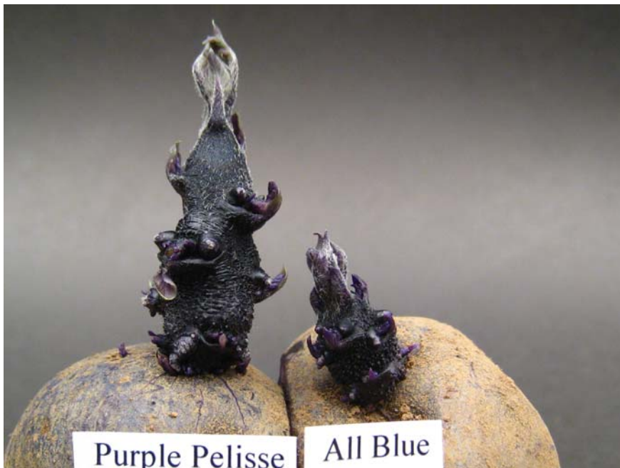
Potato: 'Purple Pelisse' (left) with reference variety 'All Blue' (right)

Proposed denomination: 'STP00-10' Application number: 09-6719 Application date: 2009/08/27 Applicant: McCain Produce Inc., Florenceville-Bristol, New Brunswick Breeder: Terrance Smith, Bristol, New Brunswick