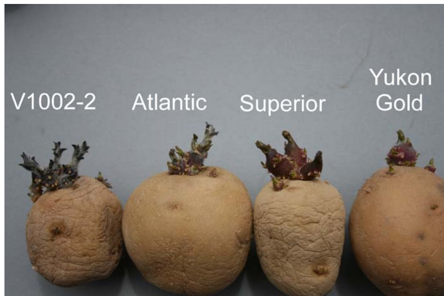
Potato: 'Vigor' (left) with reference varieties 'Atlantic' (centre) and 'Superior' (right)

Tests and Trials: Trials for 'Vigor' were conducted during the summer of 2010 at the Potato Research Centre in Fredericton, New Brunswick. Plots consisted of two replications with a row length of 9.15 meters and a row spacing of 91 cm. Plants were spaced 30 cm apart within the row. There were 60 plants per variety in the trial.