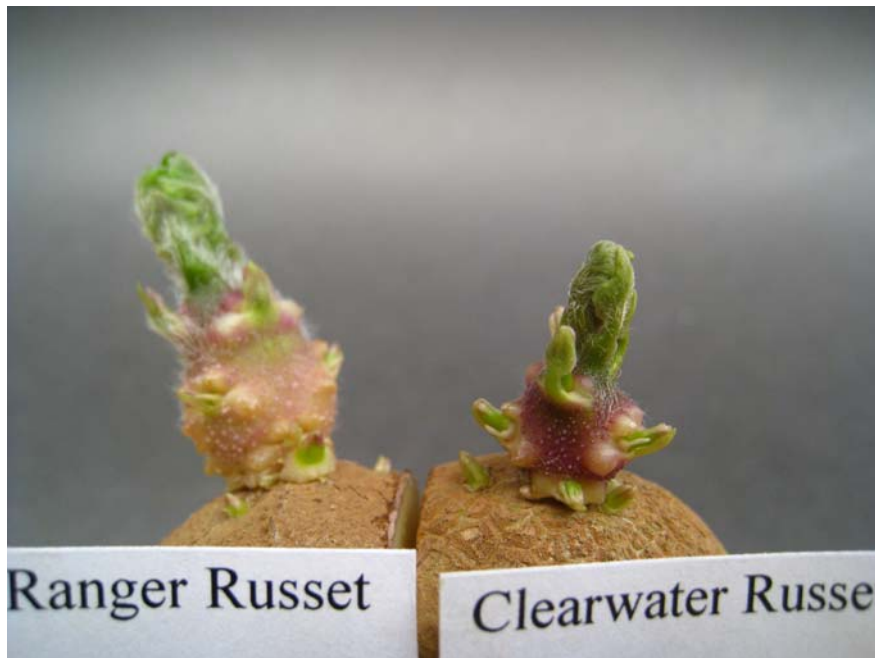
Potato: 'Clearwater Russet' (right) with reference variety 'Ranger Russet' (left)

Proposed denomination: 'Emma' Application number: 07-6046 Application date: 2007/11/16 Applicant: Irish Potato Marketing Limited, Dublin, Ireland