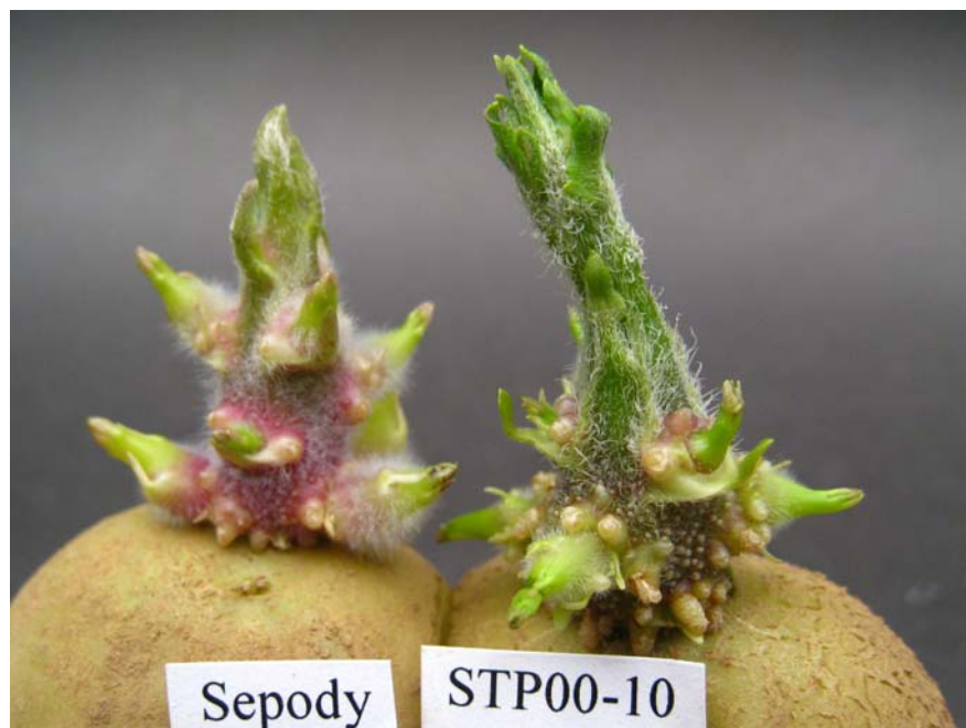
Potato: 'STP00-10' (right) with reference variety 'Shepody' (left)