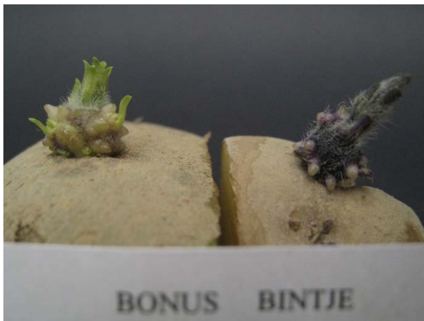
Potato: 'Bonus' (left) with reference variety 'Bintje' (right)

Tests and Trials: Trials for 'Bonus' were conducted during the summer of 2010 in Drummond, New Brunswick. Plots consisted of one row with a row length of 18.5 meters and a row spacing of 90 cm. Plants were spaced 30 cm apart within the row. There were 60 plants per variety in the trial.