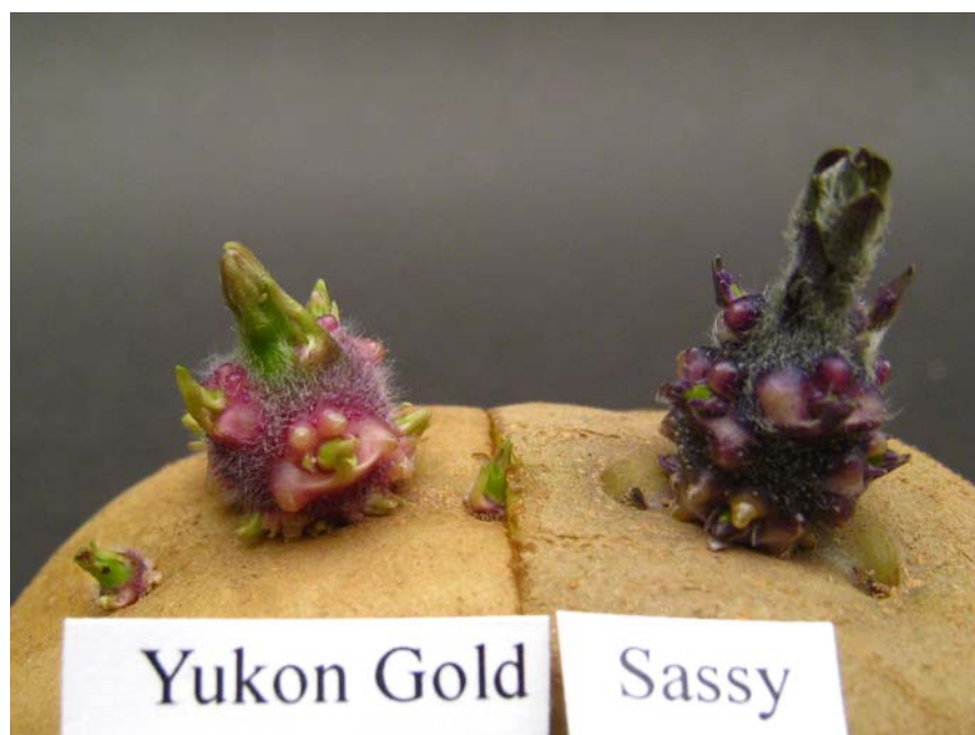
Potato: 'Sassy' (right) with reference variety 'Yukon Gold' (left)