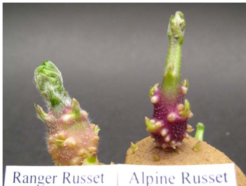
Potato: 'Alpine Russet' (right) with reference variety 'Ranger Russet' (left)