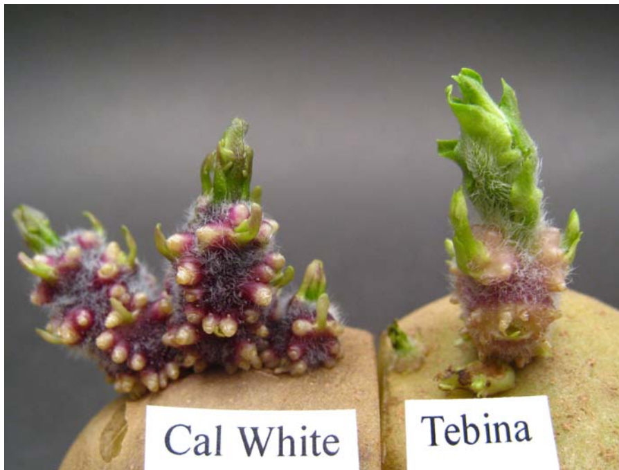
Potato: 'Tebina' (right) with reference variety 'Calwhite' (left)

Proposed denomination: 'Vigor' Application number: 09-6713 Application date: 2009/08/10 Applicant: Agriculture & Agri-Food Canada, Fredericton, New Brunswick Agent in Canada: Agriculture & Agri-Food Canada, Lacombe, Alberta Breeder: Benoit Bizimungu, Agriculture & Agri-Food Canada, Fredericton, New Brunswick