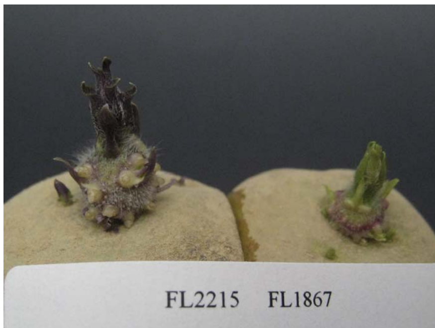
Potato: 'FL2215' (left) with reference variety 'FL1867' (right)

Tests and Trials: Trials for 'FL2215' were conducted during the summer of 2010 in Drummond, New Brunswick. Plots consisted of one row with a row length of 18.5 meters and a row spacing of 90 cm. Plants were spaced 30 cm apart within the row. There were 60 plants per variety in the trial.