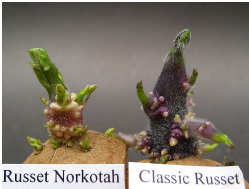
Potato: 'Classic Russet' (right) with reference variety 'Russet Norkotah' (left)