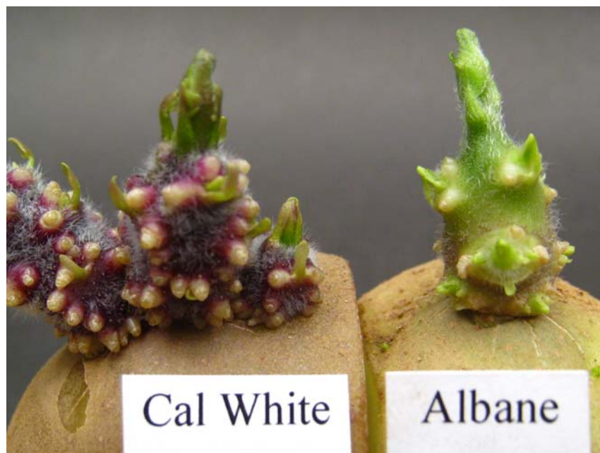
Potato: 'Albane' (right) with reference variety 'Calwhite' (left)

Tests and Trials: Trials for 'Albane' were conducted during the summer of 2010 in Drummond, New Brunswick. Plots consisted of one row with a row length of 18.5 meters and a row spacing of 90 cm. Plants were spaced 30 cm apart within the row. There were 60 plants per variety in the trial.