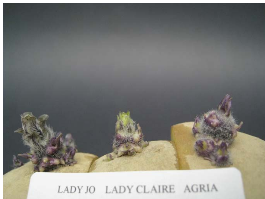
Potato: 'Lady Jo' (left) with reference varieties 'Lady Claire' (centre) and 'Agria' (right)