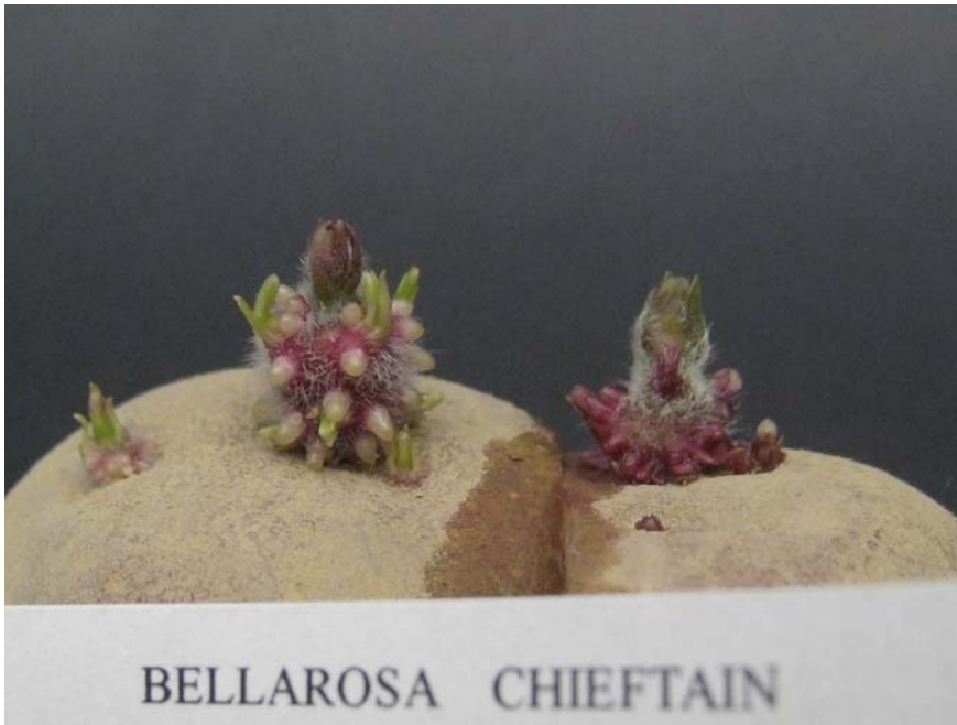
Potato: 'Bellarosa' (left) with reference variety 'Chieftain' (right)