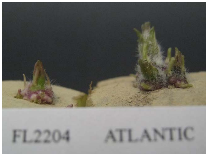
Potato: 'FL2204' (left) with reference variety 'Atlantic' (right)