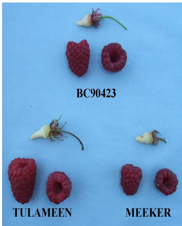
Raspberry: 'BC90423' (top, centre) with the reference varieties 'Tulameen' (bottom left) and 'Meeker' (bottom right)