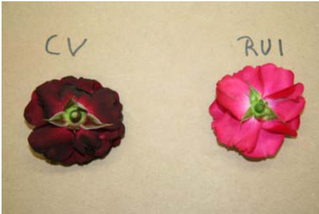
Rose: 'Navy Lady' (left) with reference variety 'Champlain' (right)