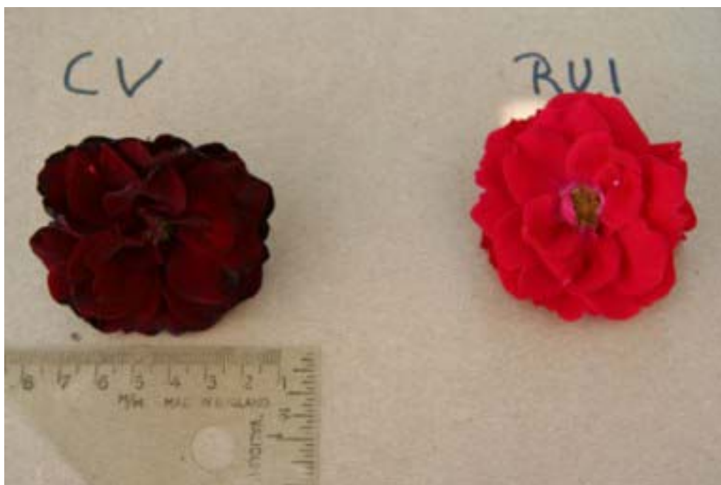
Rose: 'Navy Lady' (left) with reference variety 'Champlain' (right)