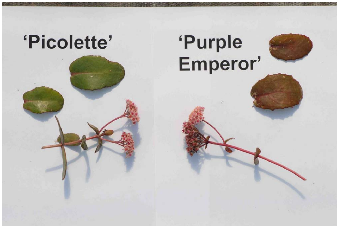
Sedum: 'Picolette' (left) with reference variety 'Purple Emperor' (right)