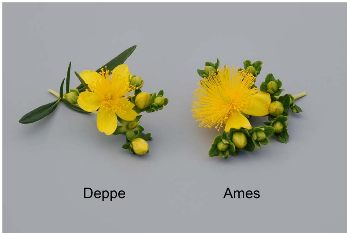
St. John's Wort: 'Deppe' (left) with reference variety 'Ames' (right)