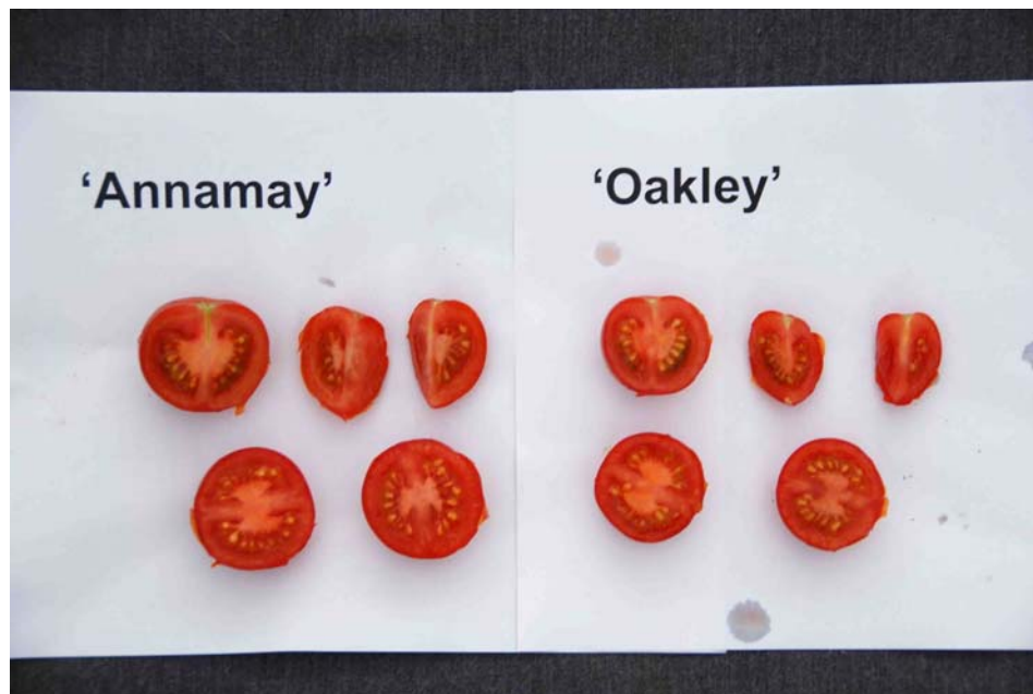
Tomato: 'Annamay' (left) with reference variety 'Oakley' (right)