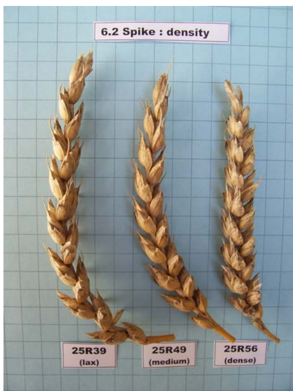
Wheat: '25R39' (left) with reference varieties '25R49' (centre) and '25R56' (right)