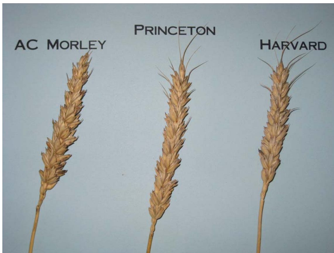
Wheat: 'Princeton' (centre) with reference varieties 'AC Morley' (left) and 'Harvard' (right)