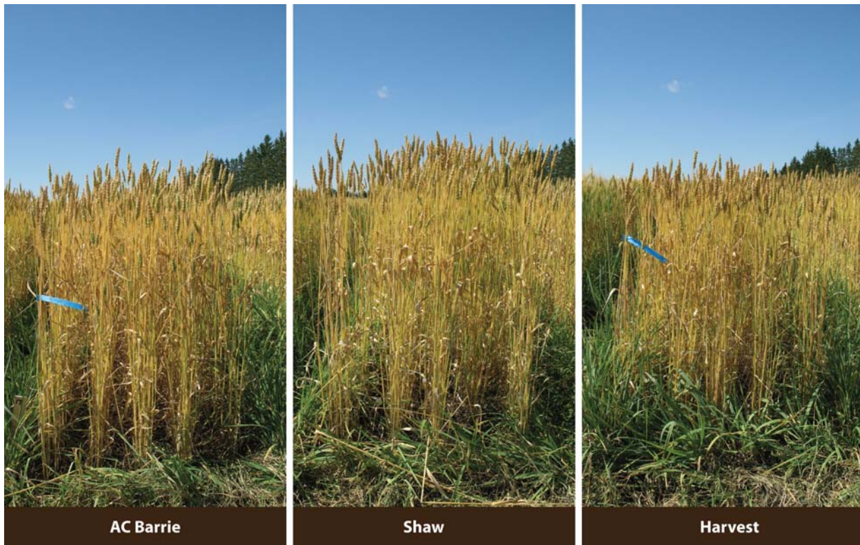
Wheat: 'Shaw' (centre) with reference varieties 'AC Barrie' (left) and 'Harvest' (right)

Proposed denomination: 'Stanford' Application number: 08-6452 Application date: 2008/10/16 Applicant: Pflanzenzucht Oberlimpurg, Schwabisch Hall, Germany Agent in Canada: C & M Seeds, Palmerston, Ontario Breeder: Peter Franck, Pflanzenzucht Oberlimpurg, Schwabisch Hall, Germany