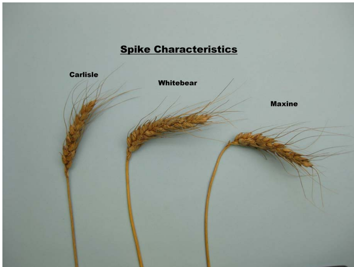
Wheat: 'Whitebear' (centre) with reference varieties 'Carlisle' (left) and 'Maxine' (right)

Proposed denomination: 'Wilkin' Application number: 08-6436 Application date: 2008/09/17 Applicant: Pflanzenzucht Oberlimpurg, Schwabisch Hall, Germany Agent in Canada: C & M Seeds, Palmerston, Ontario Breeder: Peter Franck, Pflanzenzucht Oberlimpurg, Schwabisch Hall, Germany