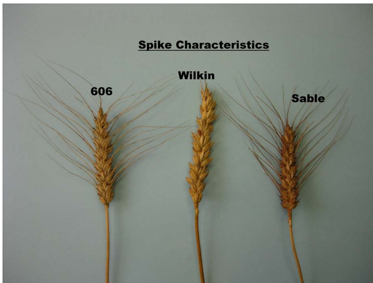
Wheat: 'Wilkin' (centre) with reference varieties '606' (left) and 'Sable' (right)