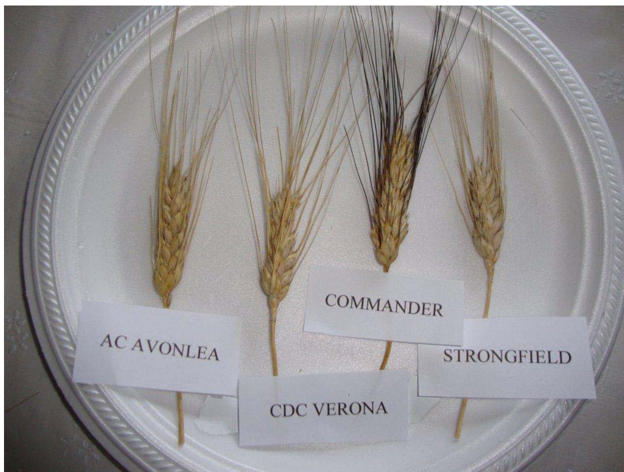
Wheat: 'CDC Verona' (centre left) with reference varieties 'AC Avonlea' (left), 'Commander' (centre right), and 'Strongfield' (right)