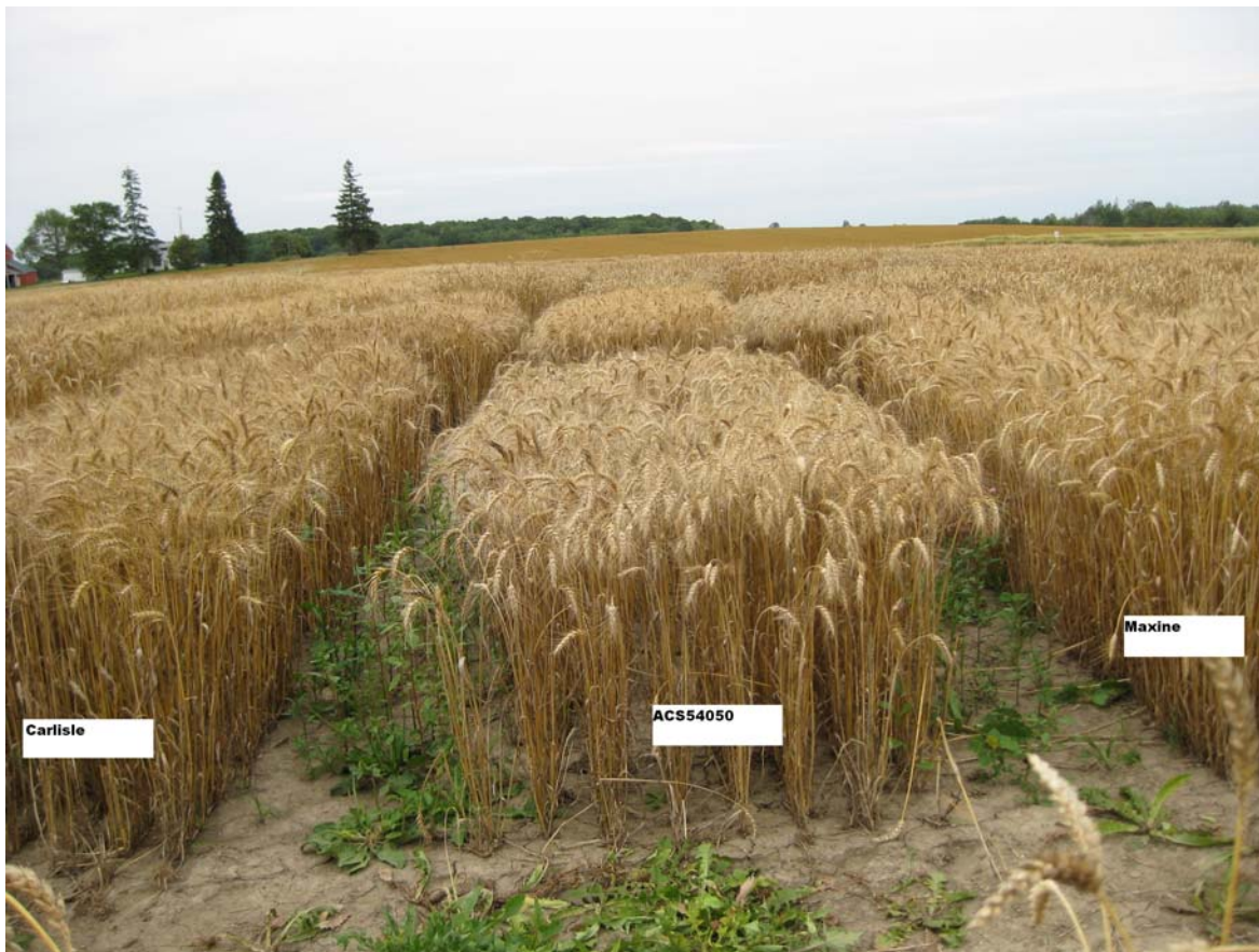
Wheat: 'Whitebear' (centre) with reference varieties 'Carlisle' (left) and 'Maxine' (right)