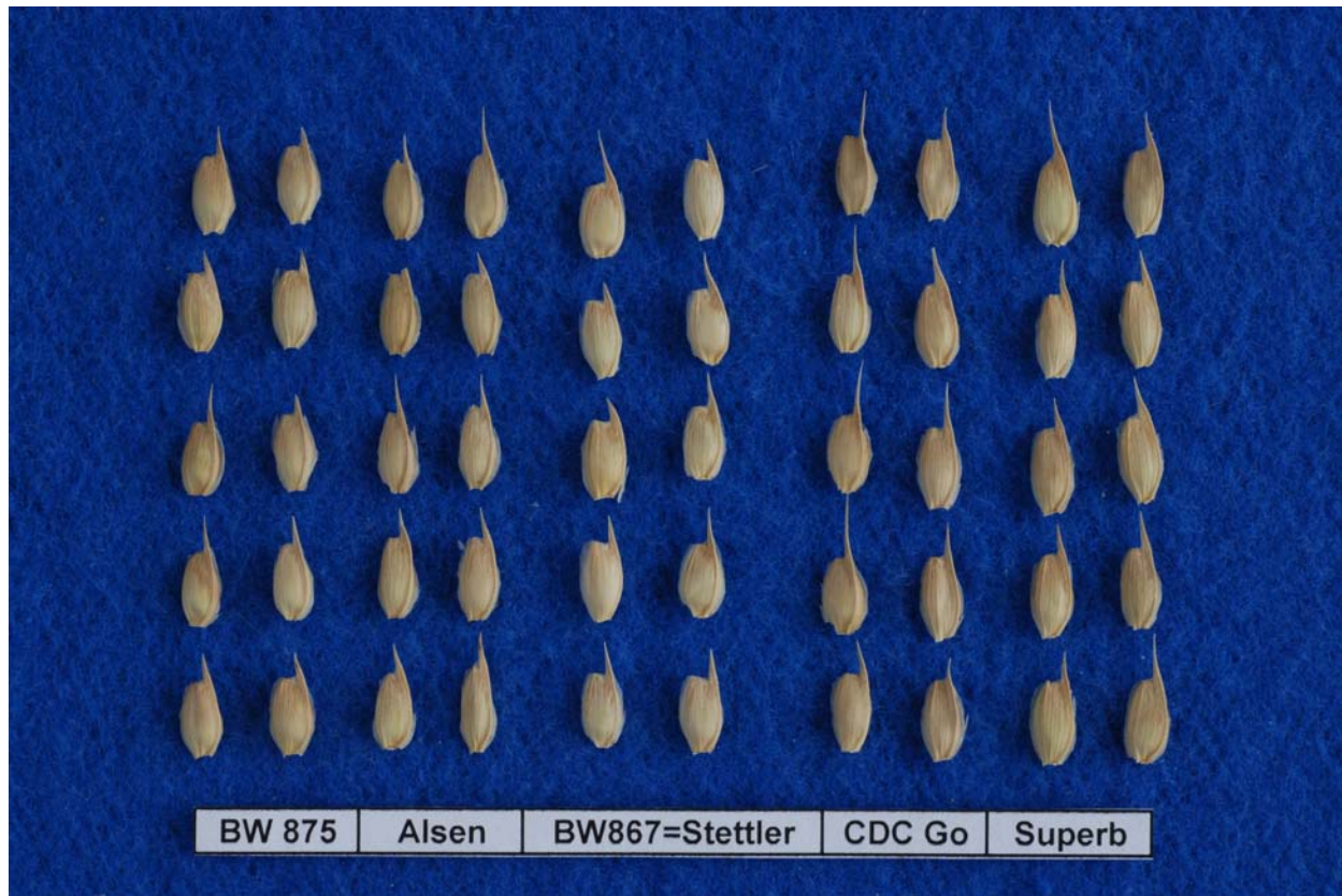
Wheat: ‘Muchmore’ (BW875) (left) with reference varieties ‘Alsen’ (centre left), ‘Stettler’ (centre), ‘CDC Go’ (centre right), and ‘Superb’ (right)