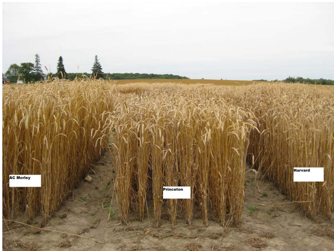
Wheat: 'Princeton' (centre) with reference varieties 'AC Morley' (left) and 'Harvard' (right)