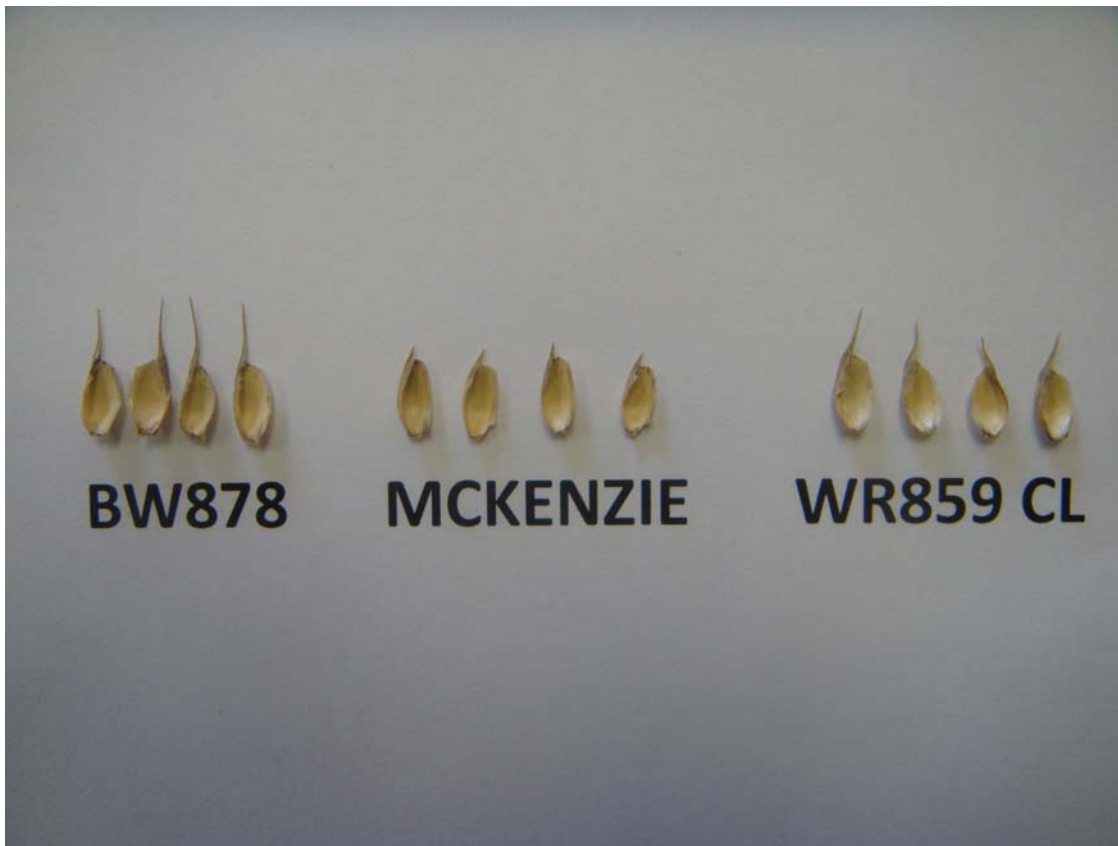
Wheat: ‘5604HR CL’ (BW878) (left) with reference varieties ‘McKenzie’ (centre) and ‘WR859 CL’ (right)