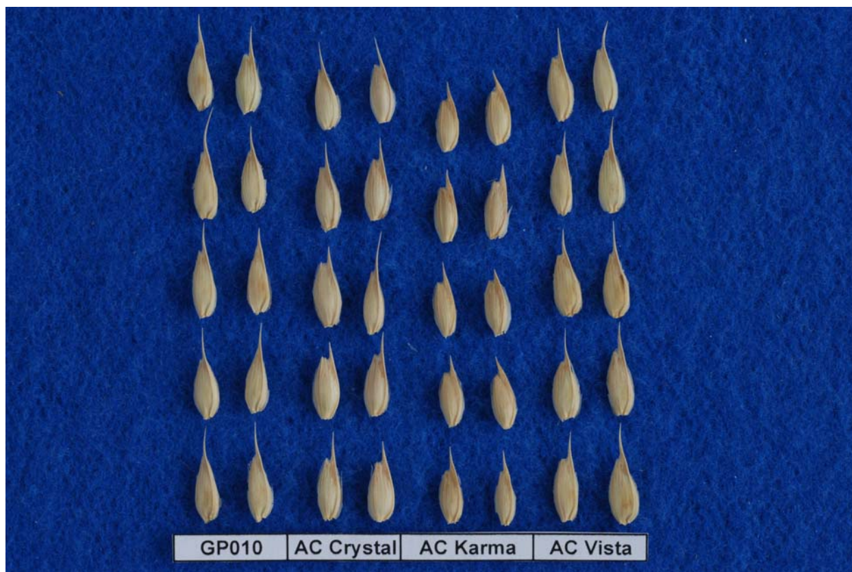
Wheat: 'NRG101' (GP010) (left) with reference varieties 'AC Crystal' (centre left), 'AC Karma' (centre right), and 'AC Vista' (right)

Proposed denomination: 'Princeton' Application number: 08-6451 Application date: 2008/10/16 Applicant: Pflanzenzucht Oberlimpurg, Schwabisch Hall, Germany Agent in Canada: C & M Seeds, Palmerston, Ontario Breeder: Peter Franck, Pflanzenzucht Oberlimpurg, Schwabisch Hall, Germany