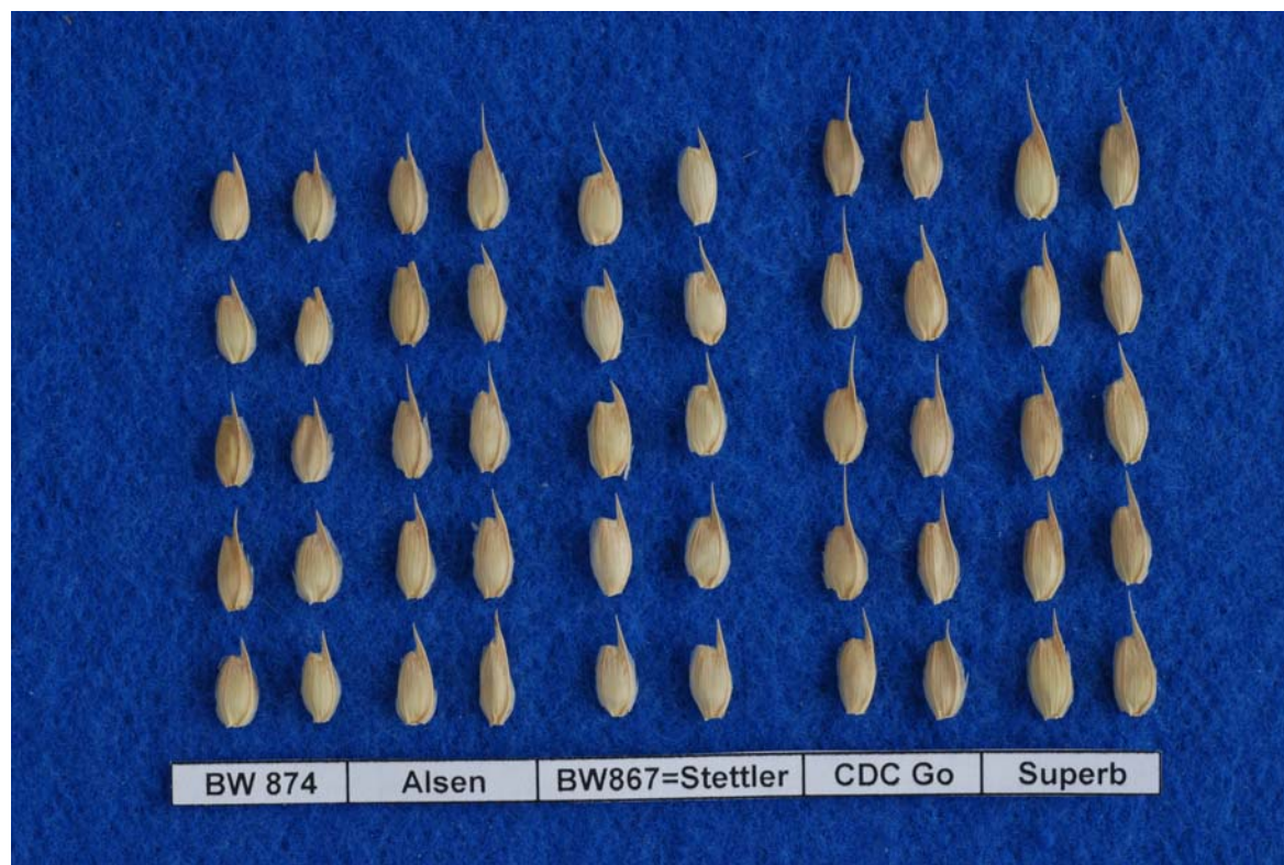
Wheat: 'Carberry' (BW874) (left) with reference varieties 'Alsen' (centre left), 'Stettler' (centre), 'CDC Go' (centre right), and 'Superb' (right)