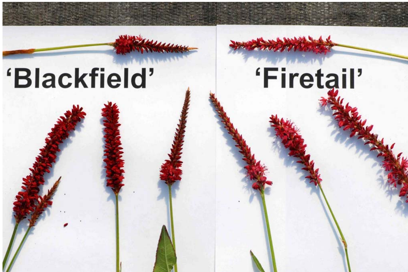
Bistort: 'Blackfield' (left) with reference variety 'Firetail' (right)

Proposed denomination: 'Orange Field' Application number: 06-5329 Application date: 2006/03/17 Applicant: Chris Ghyselen, Beernhem, Belgium Agent in Canada: Variety Rights Management, Oxford Station, Ontario Breeder: Chris Ghyselen, Beernhem, Belgium