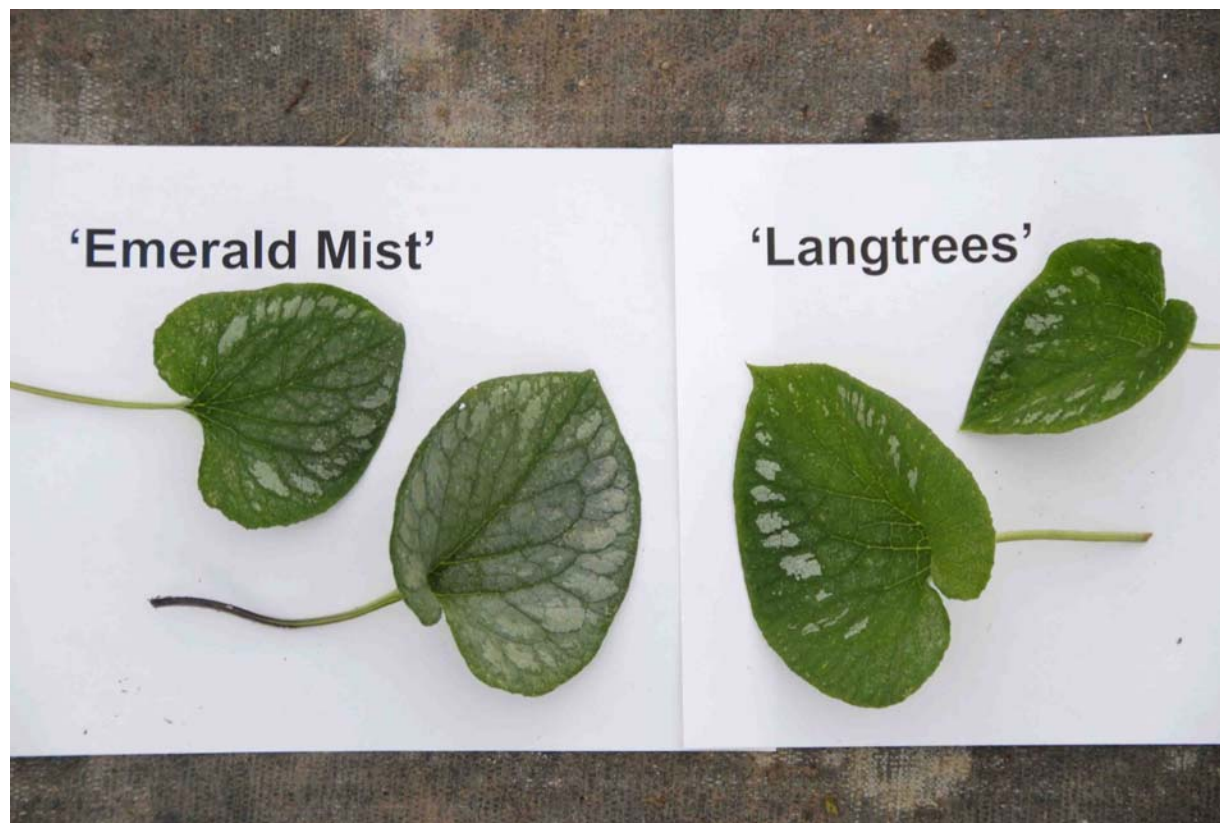
Brunnera: 'Emerald Mist' (left) with reference variety 'Langtrees' (right)