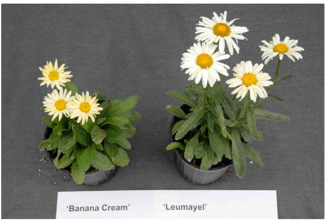
Shasta Daisy: 'Banana Cream' (left) with reference variety 'Leumayel' (right)