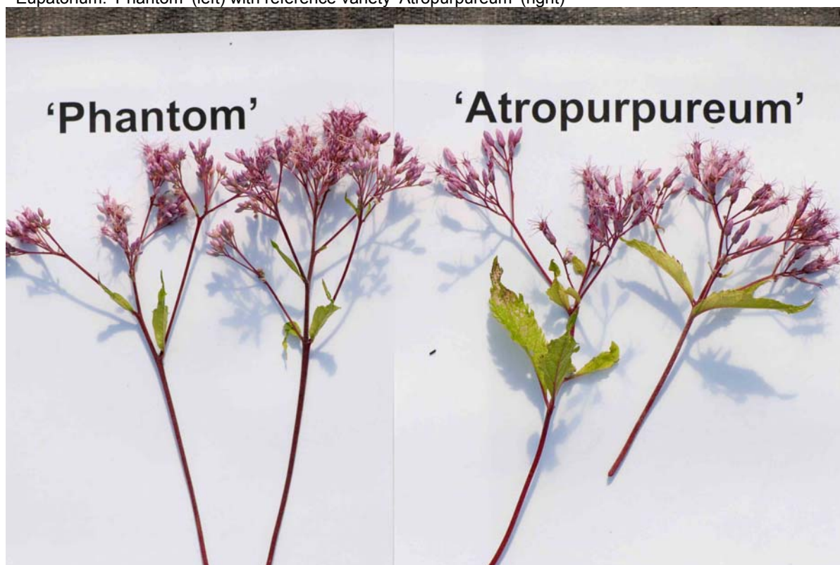
Eupatorium: 'Phantom' (left) with reference variety 'Atropurpureum' (right)