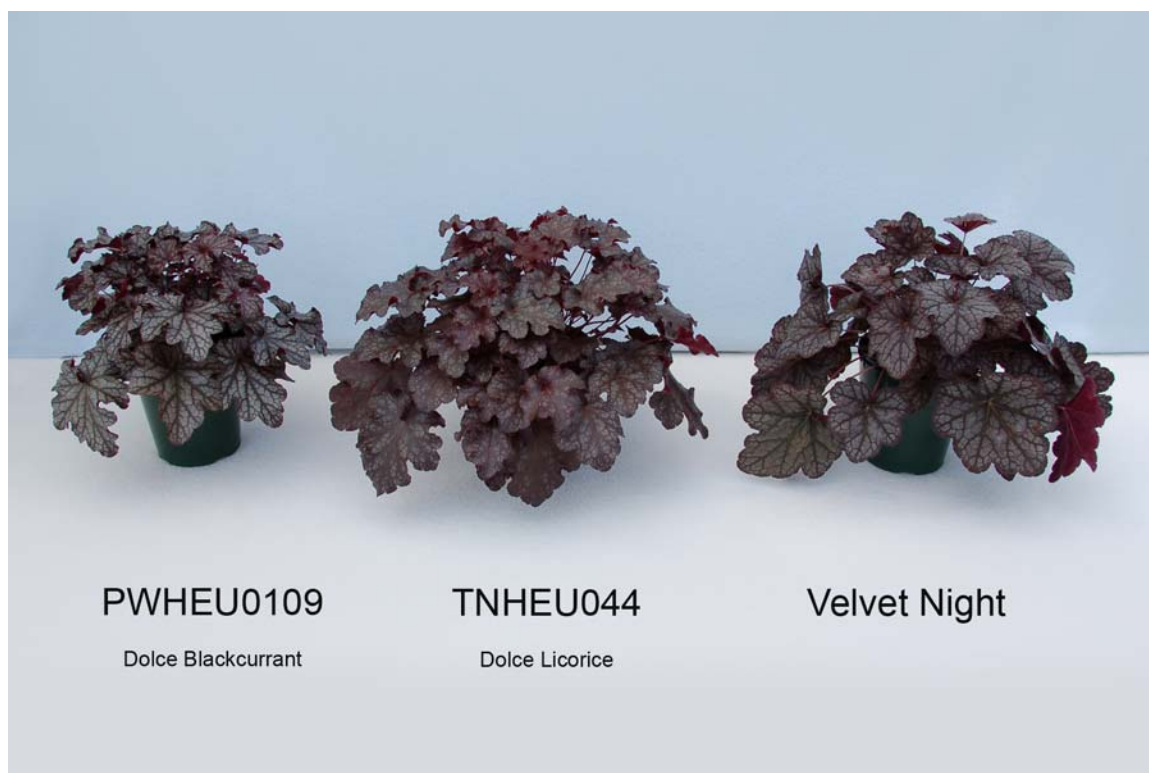
Heuchera: 'PWHEU0109' (left) with reference varieties 'TNHEU044' (centre) and 'Velvet Night' (right)