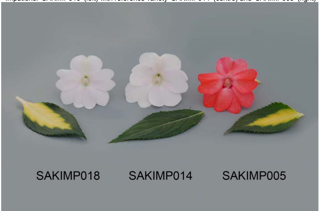
Impatiens: 'SAKIMP018' (left) with reference variety 'SAKIMP014' (centre) and 'SAKIMP005' (right)