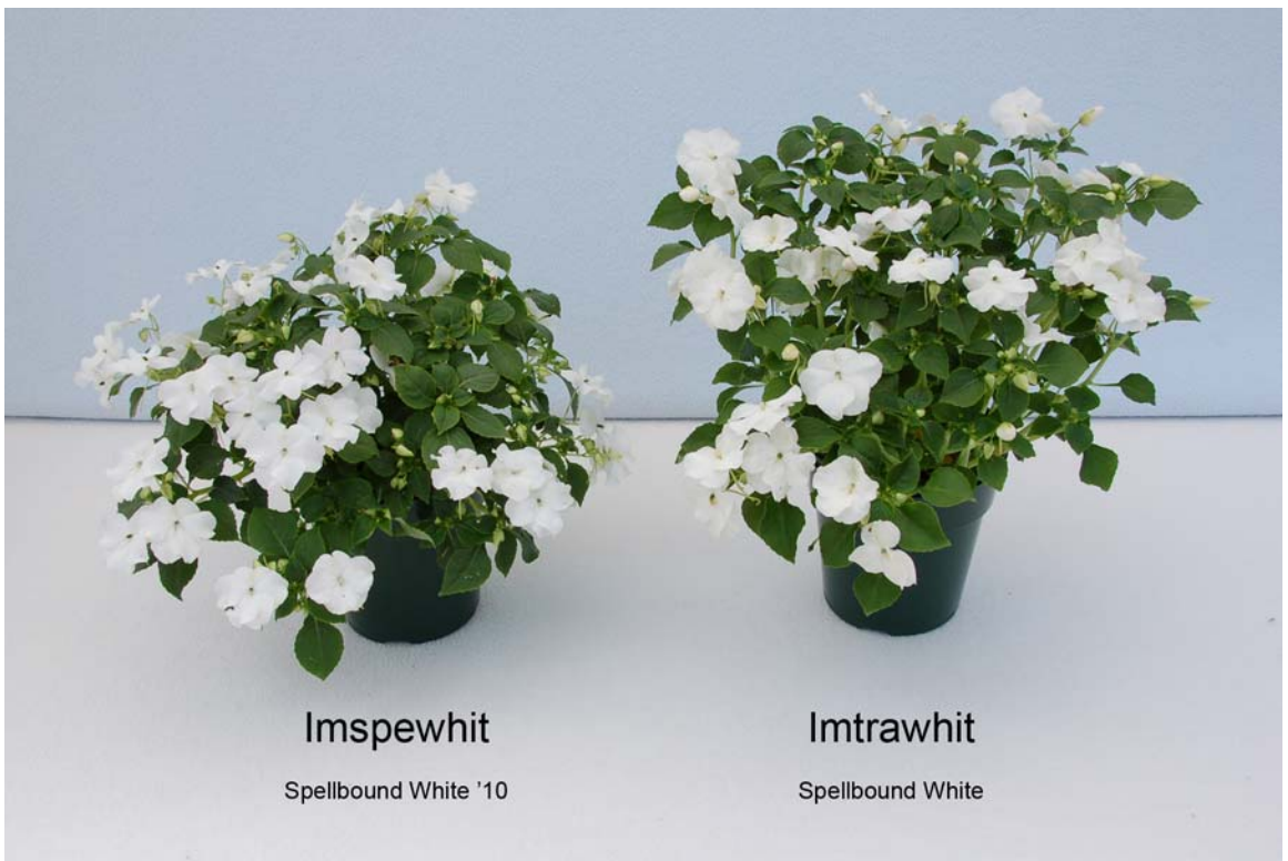
Impatiens: 'Imspewhit' (left) with reference variety 'Imtrawhit' (right)