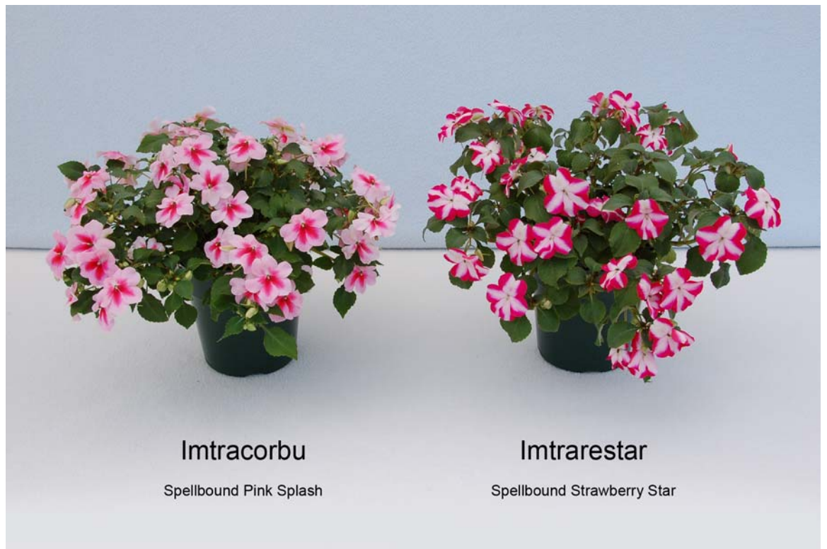
Impatiens: 'Imtracorbu' (left) with reference variety 'Imtrarestar' (right)