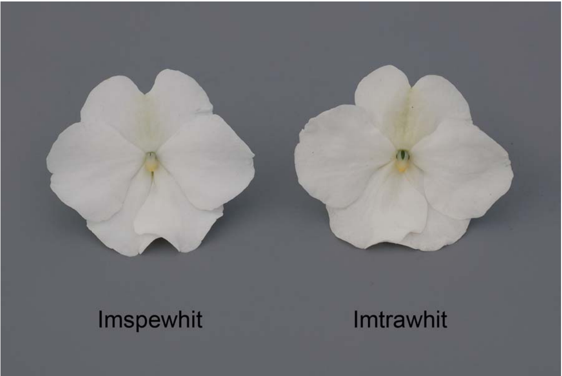
Impatiens: 'Imspewhit' (left) with reference variety 'Imtrawhit' (right)