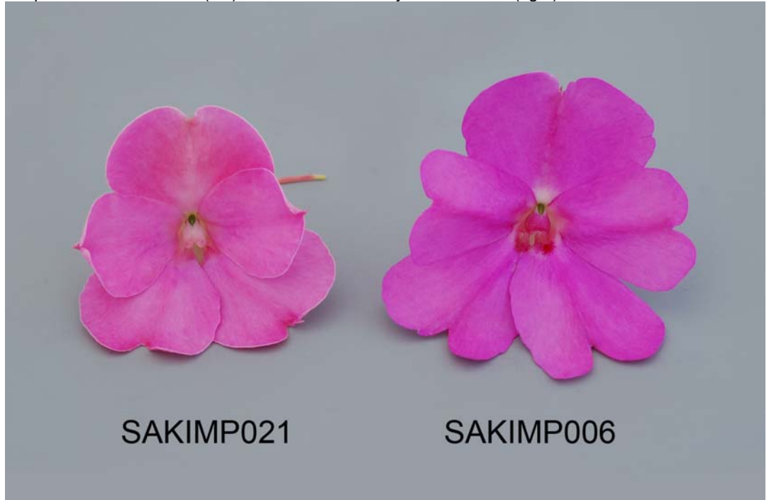
Impatiens: 'SAKIMP021' (left) with reference variety 'SAKIMP006' (right)