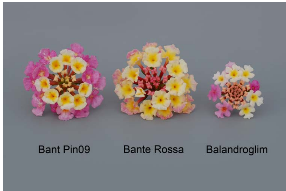
Lantana: 'Bant Pin09' (left) with reference varieties 'Bante Rossa' (center) and 'Balandroglim' (right)