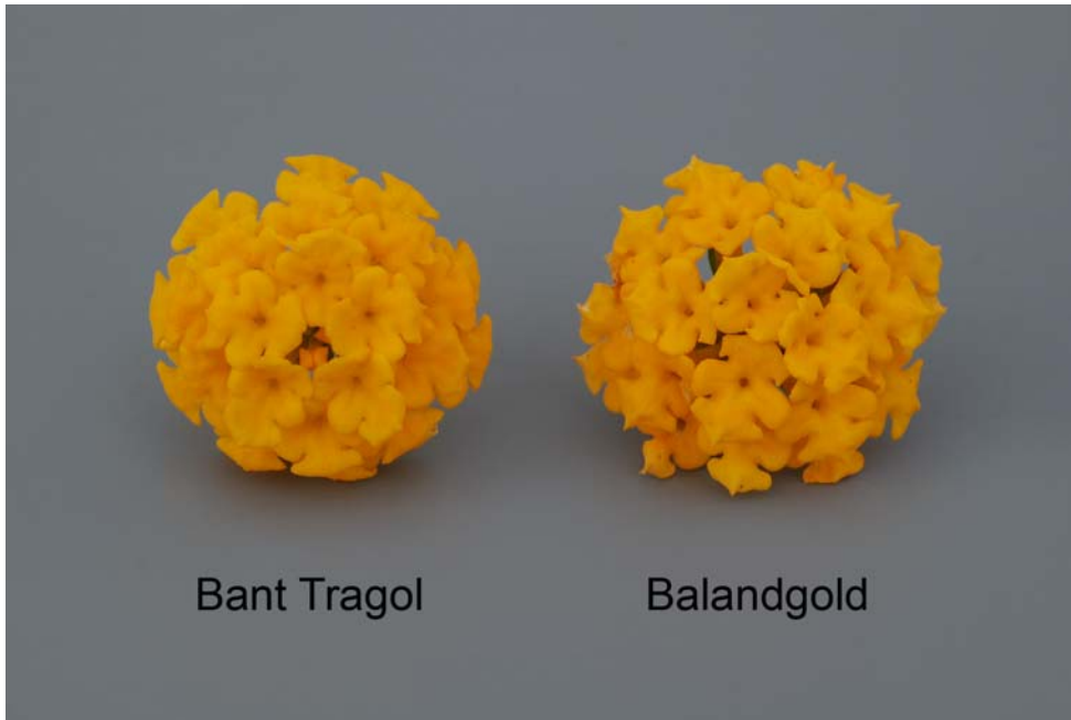
Lantana: 'Bant Tragol' (left) with reference variety 'Balandgold' (right)