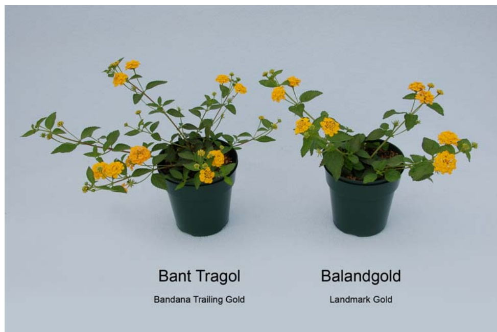
Lantana: 'Bant Tragol' (left) with reference variety 'Balandgold' (right)