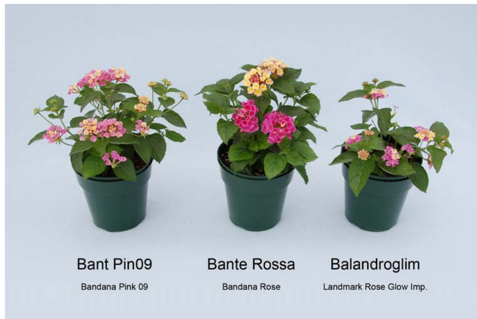
Lantana: 'Bant Pin09' (left) with reference varieties 'Bante Rossa' (center) and 'Balandroglim' (right)