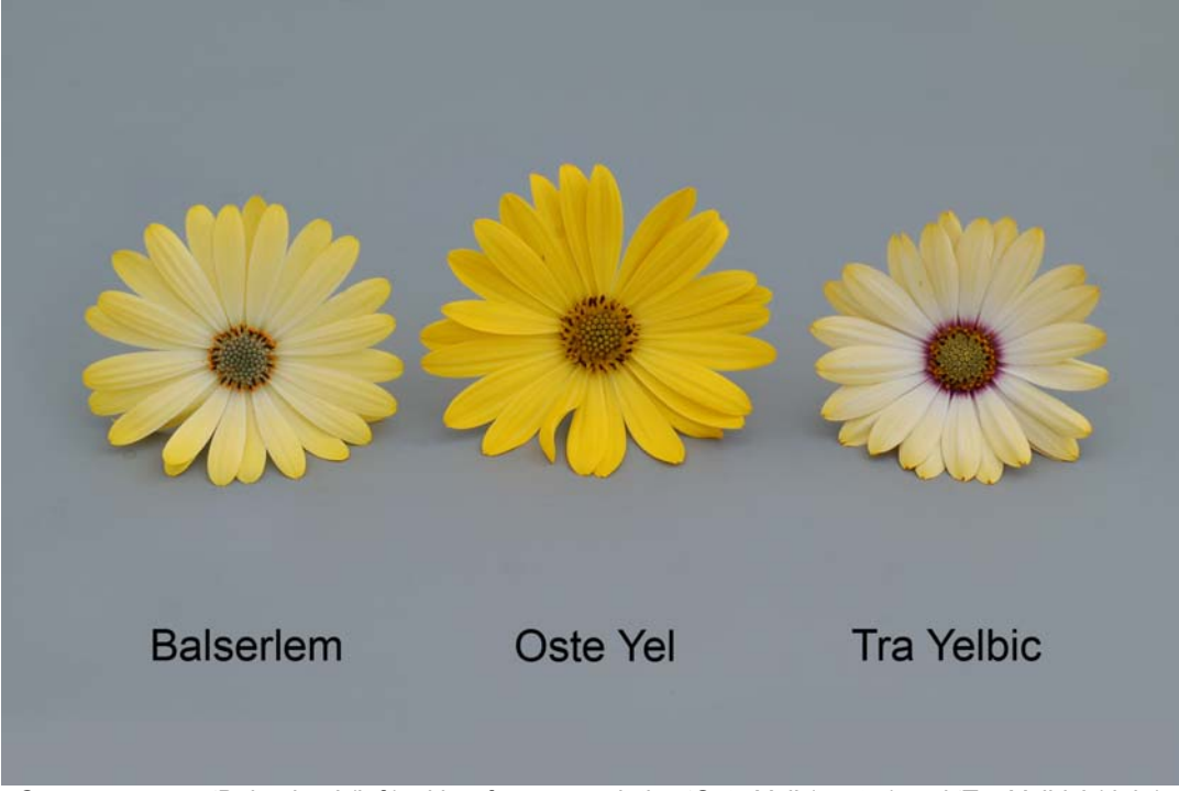
Osteospermum: 'Balserlem' (left) with reference varieties 'Oste Yel' (centre) and 'Tra Yelbic' (right)