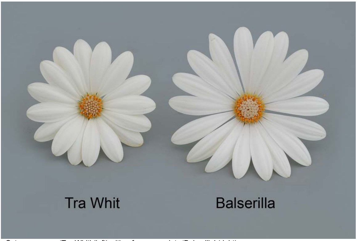
Osteospermum: 'Tra Whit' (left) with reference variety 'Balserilla' (right)