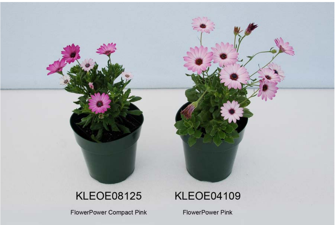
Osteospermum: 'KLEOE08125' (left) with reference variety 'KLEOE04109' (right)