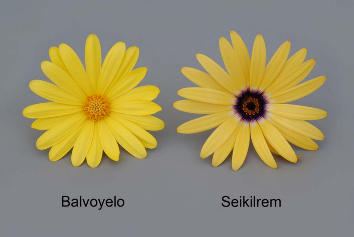
Osteospermum: 'Balvoyelo' (left) with reference variety 'Seikilrem' (right)