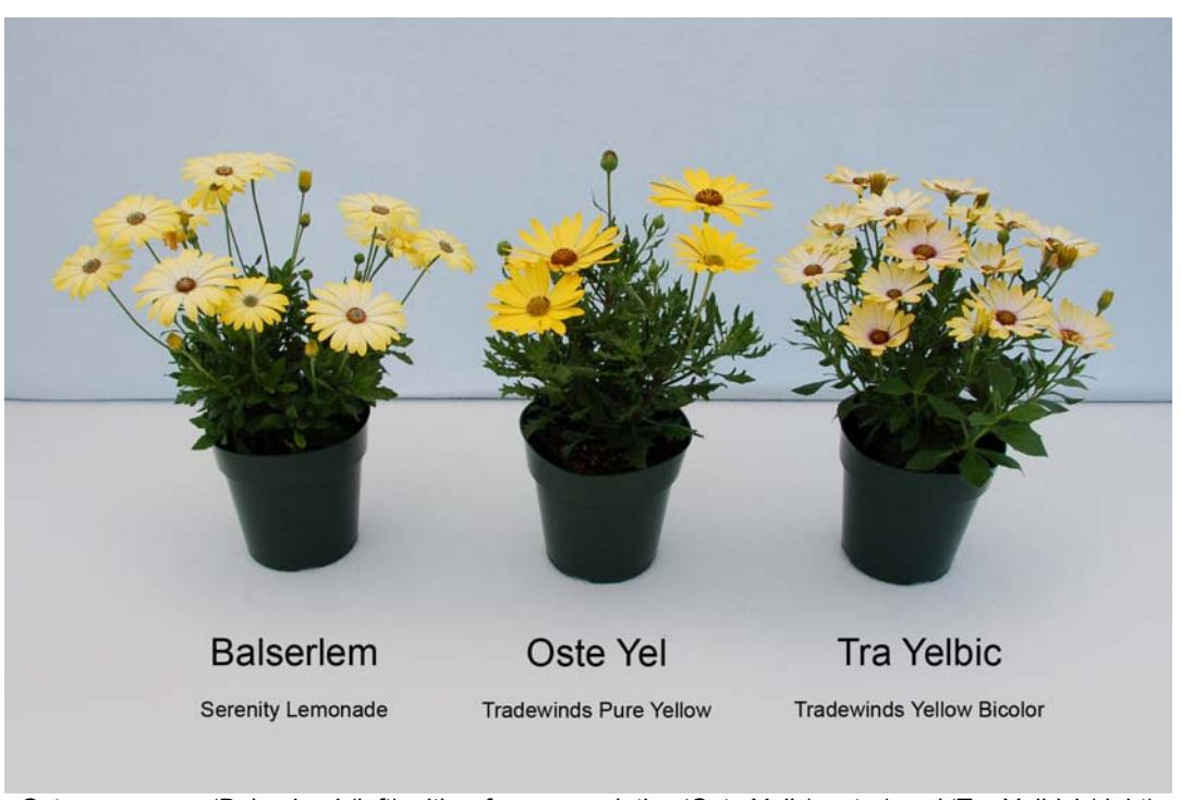
Osteospermum: 'Balserlem' (left) with reference varieties 'Oste Yel' (centre) and 'Tra Yelbic' (right)