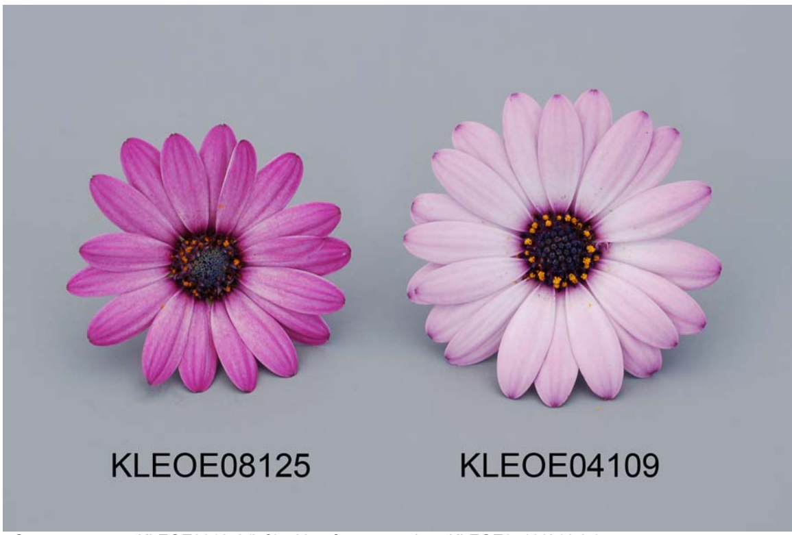
Osteospermum: 'KLEOE08125' (left) with reference variety 'KLEOE04109' (right)