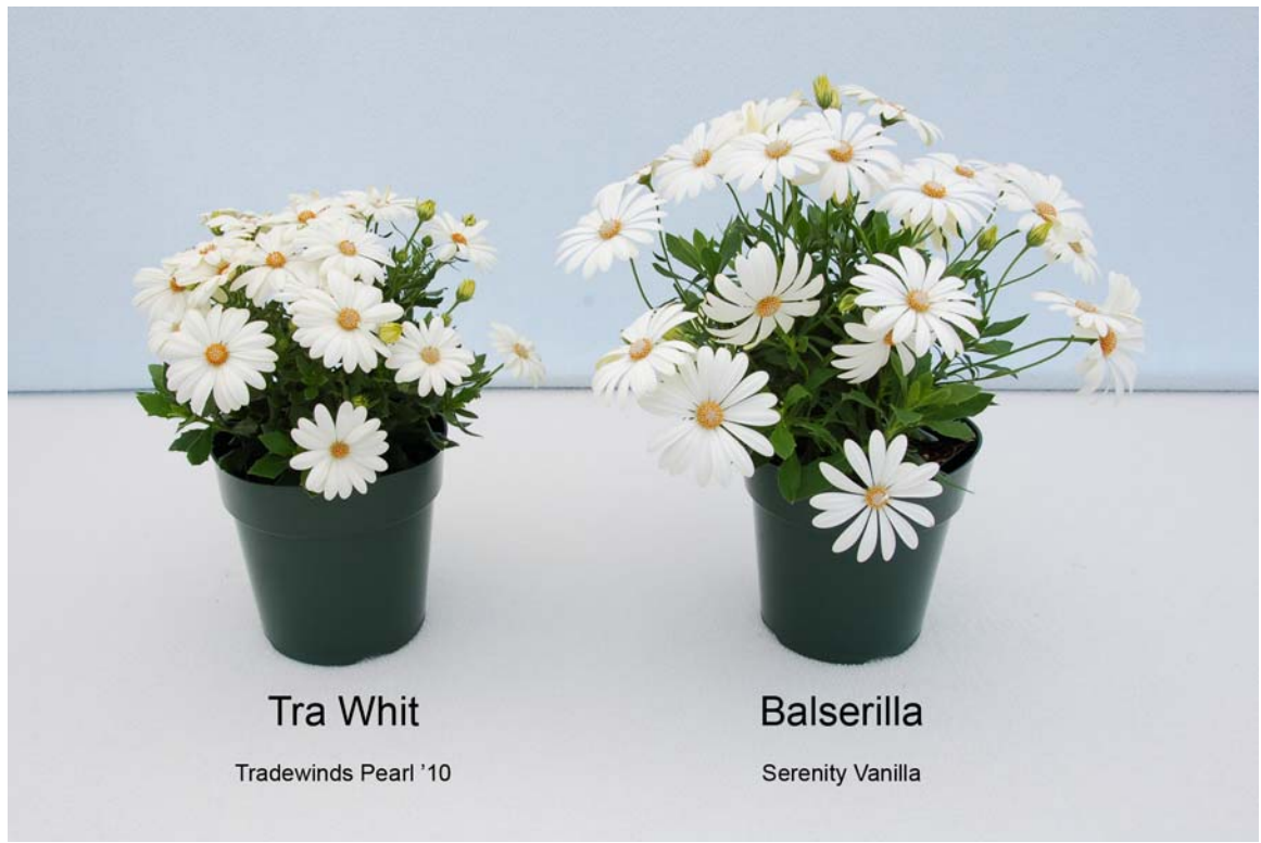
Osteospermum: 'Tra Whit' (left) with reference variety 'Balserilla' (right)