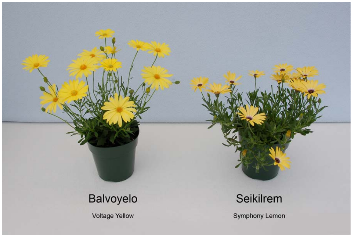
Osteospermum: 'Balvoyelo' (left) with reference variety 'Seikilrem' (right)