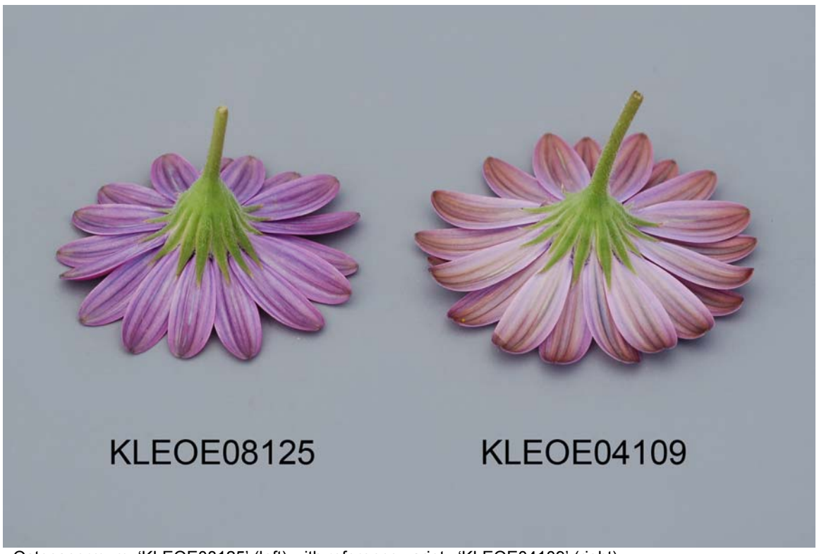
Osteospermum: 'KLEOE08125' (left) with reference variety 'KLEOE04109' (right)

Proposed denomination: 'KLEOE08161' Trade name: Zion Orange Application number: 08-6258 Application date: 2008/03/31