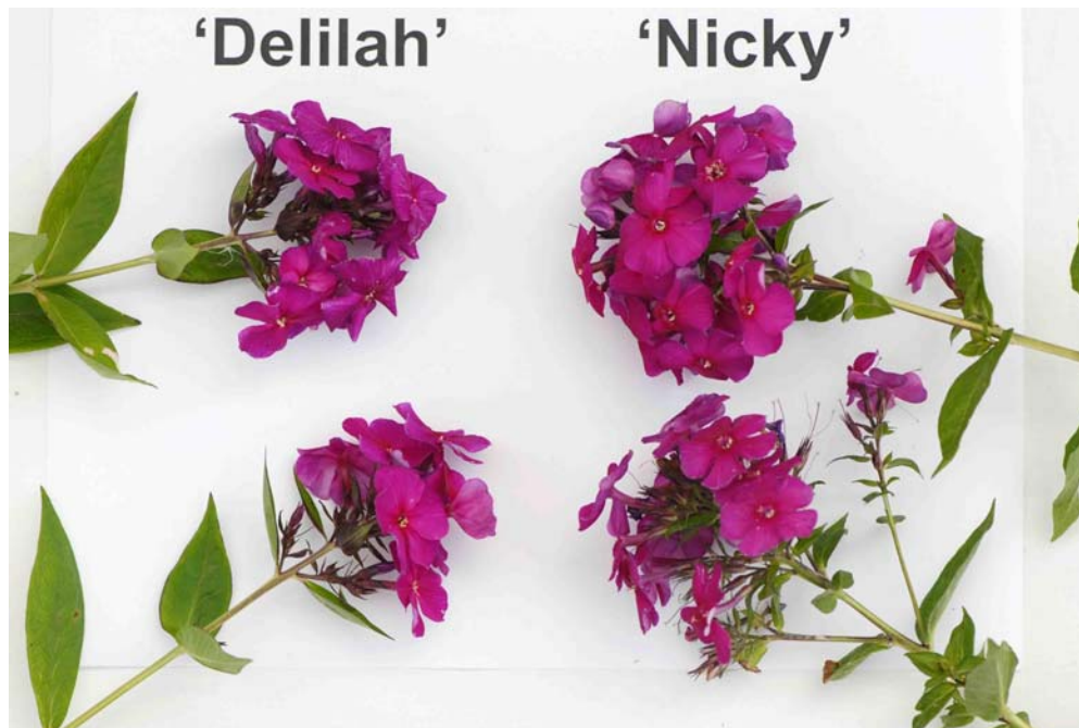
Phlox: 'Delilah' (left) with reference variety 'Nicky' (right)