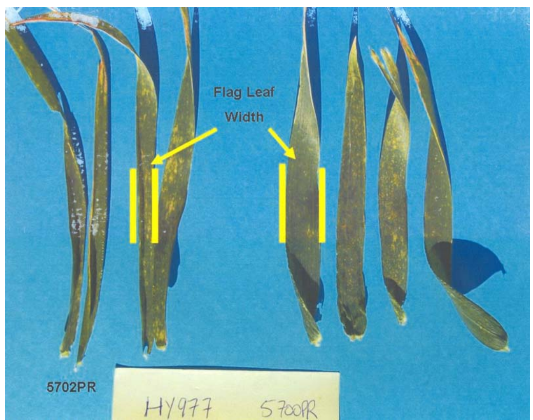
Wheat: '5702PR' (left) with reference variety '5700PR' (right)