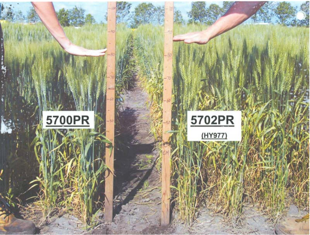
Wheat: '5702PR' (right) with reference variety '5700PR' (left)