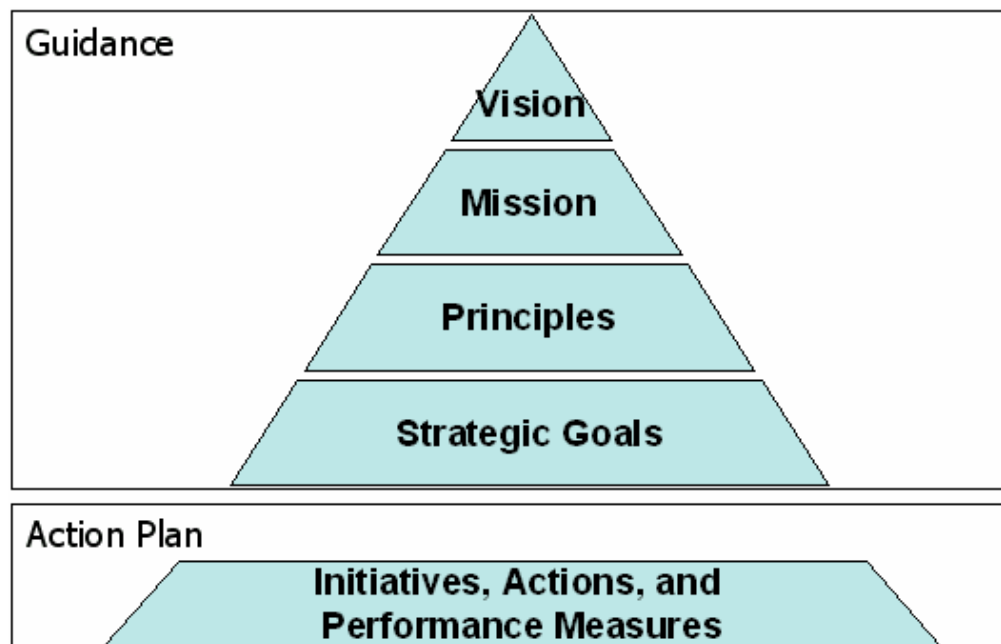
Figure 2: Framework for moving toward a common vision.

Future work includes the collaborative development of an Action Plan as well as a process for addressing new issues as they arise and a protocol for decision-making.