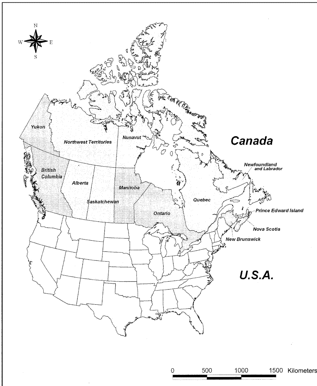
Figure 1. Canadian provinces and territory from which Fisheries Act Section 35(2) authorizations were collected.

equal to or greater than that of the habitats impacted by the HADD (or reference sites representing the habitats impacted by the HADD). Pre- and post-con-