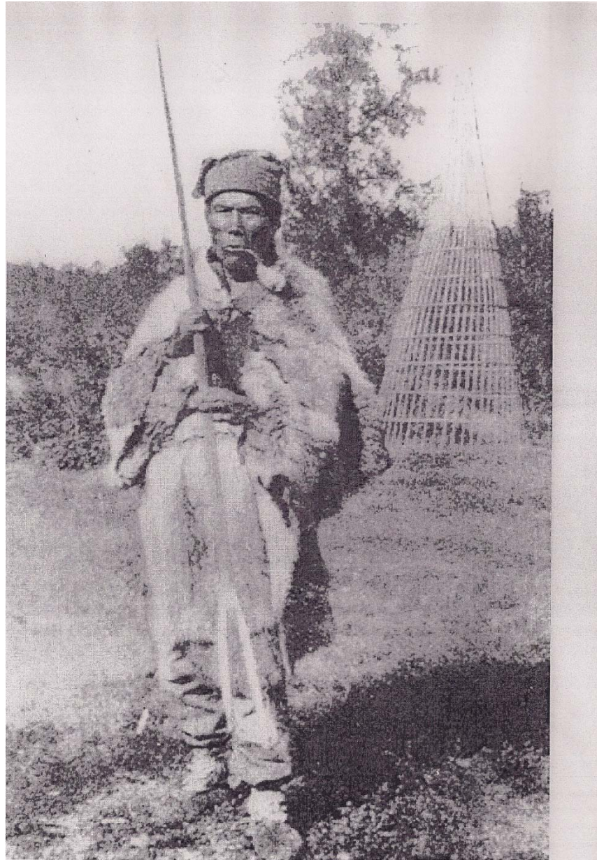
Size Of Fish Weir